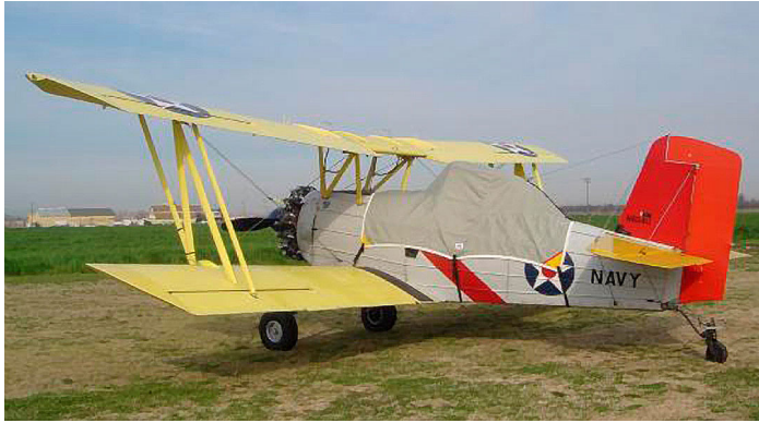
Grumman Ag Cat Canopy Cover

Canopy Covers are commonly referred to as Cabin Covers, Fuselage Covers, Canvas Covers, Canopy Caps, etc.