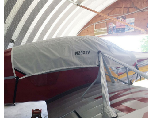
Callair A-2 Canopy Cover