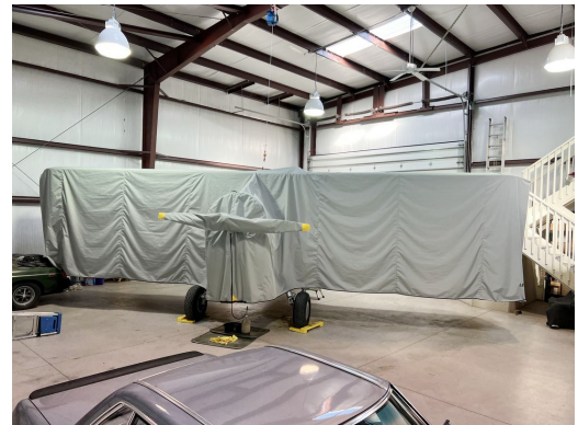
Stearman PT-13 Full Body Dust Cover