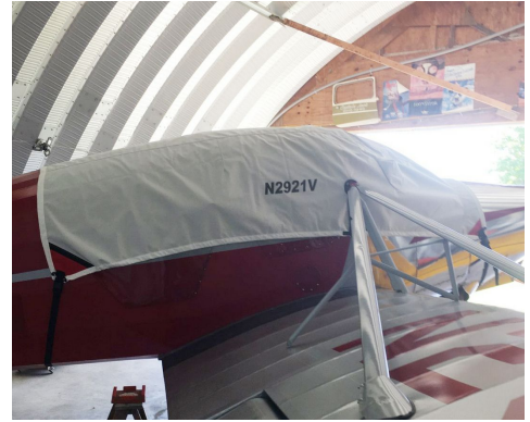
Callair A-2 Canopy Cover