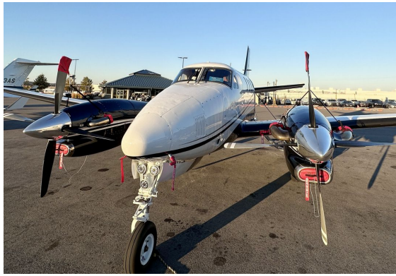
Beech King Air C90A Plug & Prop Tie Set