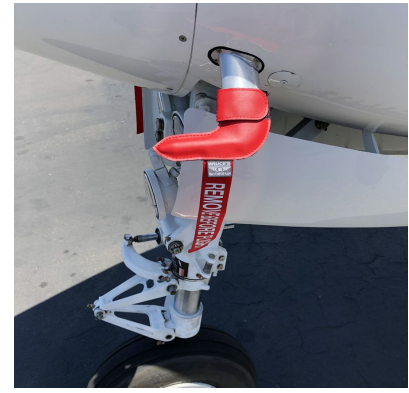
Beech King Air Pitot Covers