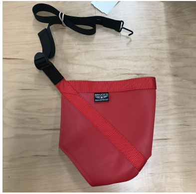
Prop Tie-Down, Various Models (secures with a hook to engine nacelle)

the hottest of days. It is water, ice and snow repellent, yet breathable to allow moisture to escape from between the cover and the aircraft surface.