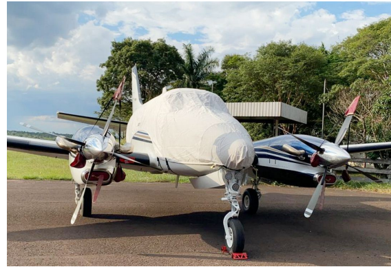
King Air C90GTi Canopy/Nose Cover