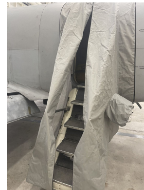
King Air Airstair Coor Cover