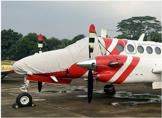
Beech King Air 200 Cockpit/Nose Cover