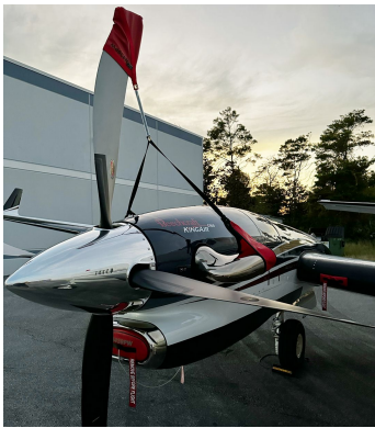
Beech King Air C90A Prop-Tie-Down/Exhaust Covers

the hottest of days. It is water, ice and snow repellent, yet breathable to allow moisture to escape from between the cover and the aircraft surface.