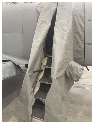
King Air Airstair Door Cover

WINTER USE MATERIAL - Made with Solution-Dyed Polyester fabric, this option is intended for seasonal use to aid in deicing, rain mitigation, or for occasional travel. The material is lighter and more compact, but more susceptible to UV damage and may have a shorter useful life if used continuously outside than the all-year use material.