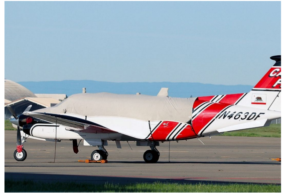
Beech King Air B200 Canopy/Nose Cover