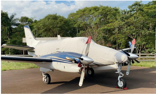
King Air C90GTi Canopy/Nose Cover

The material is very reflective, and tests show that the cabin interior temperature can be reduced to near-ambient temperature on the hottest of days. It is water, ice and snow repellent, yet breathable to allow moisture to escape from between the cover and the aircraft surface.