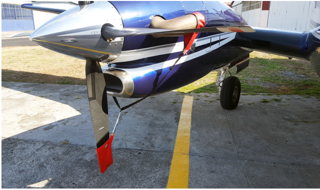
Beech King Air C90A Prop Tie-Downs/Exhaust Covers

the hottest of days. It is water, ice and snow repellent, yet breathable to allow moisture to escape from between the cover and the aircraft surface.