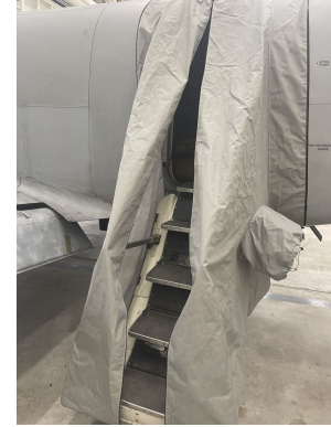
King Air Airstair Door Cover