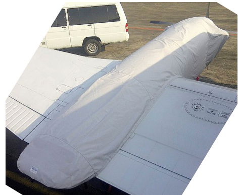
King Air 350 Engine Cover