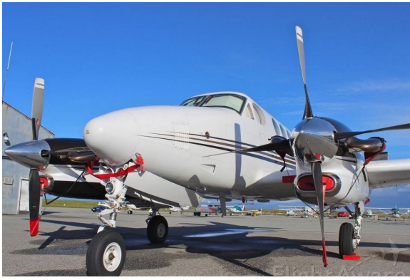
King Air C90A Engine Plugs and Pitot Covers