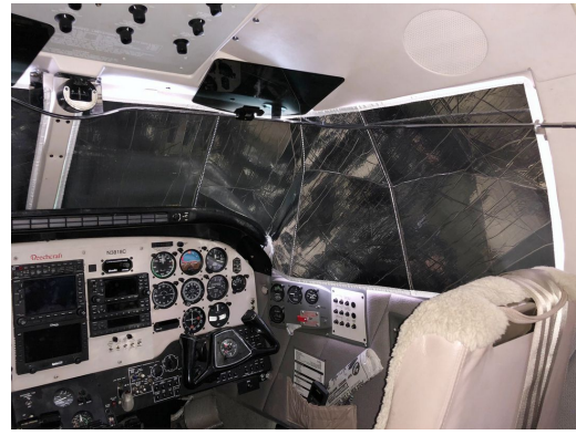
Beech King Air 90 & 100 (U-21, RU-21, T-44) Cockpit Heatshields