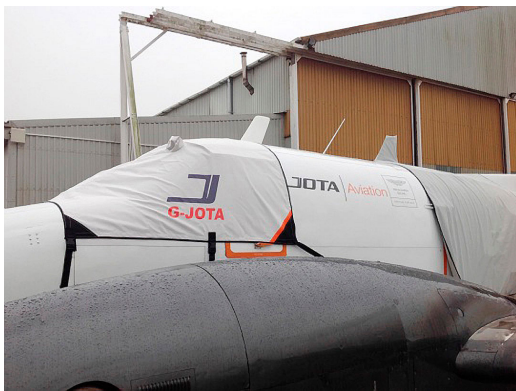
King Air Windshield/Cockpit Cover

Travel Covers are made with Silver Solution-Dyed Polyester fabric and only lined over the windshield to save weight. The material is lightweight and more compact for easy stowage in the aircraft. The polyester material is water resistant, but only intended for occasional use outside. We also have an ultra lightweight material available for fitted hangar dust covers. For daily outdoor use, the non-travel Sunbrella Cover is the best choice.