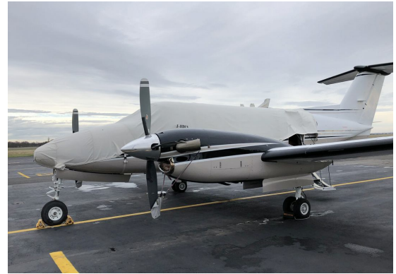
King Air 200 Canopy/Nose Cover