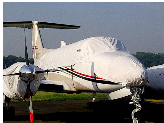
King Air 350 Canopy/Nose Cover, Engine Covers