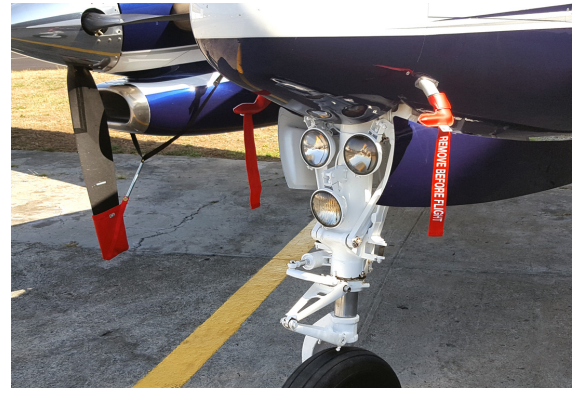
Beech King Air C90A Pitot Covers