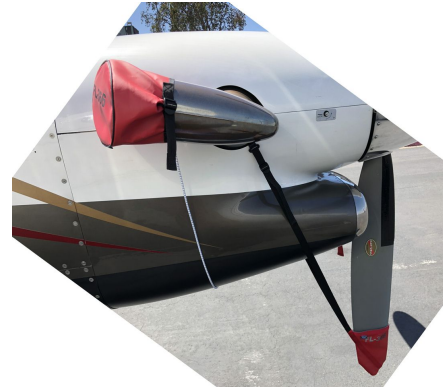
Beech King Air 350 Prop Tie-Downs/Exhaust Covers Combination