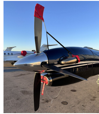
Beech King Air C90A Plug & Prop Tie Set