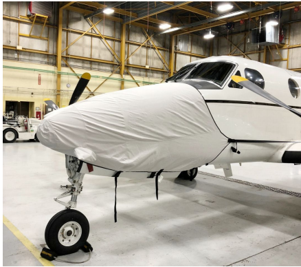
King Air 200 Nose Cover

The material is very reflective, and tests show that the cabin interior temperature can be reduced to near-ambient temperature on the hottest of days. It is water, ice and snow repellent, yet breathable to allow moisture to escape from between the cover and the aircraft surface.