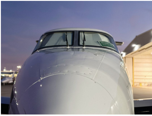
Beechcraft B200 Cockpit Heatshields