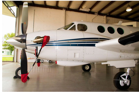
Beech King Air C90A Engine/Oil Cooler Inlet Plugs