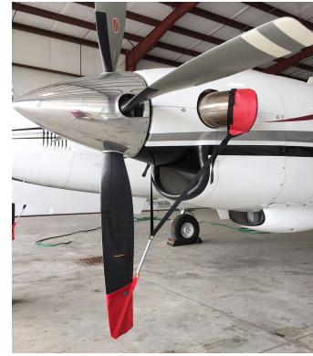
Beech King Air C90 Prop Tie/Exhaust Cover Set