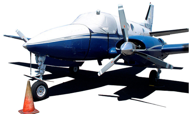
Beech King Air Windshield Cover