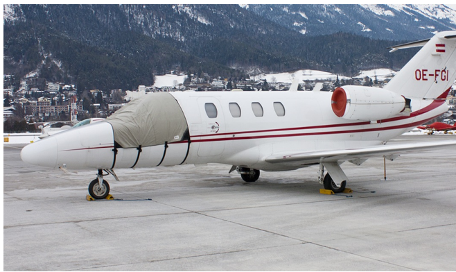
Cessna Citationjet CJ1 Cockpit Cover