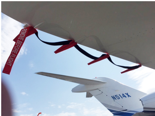
Citation X Static Wick Protectors

ALL-YEAR USE MATERIAL - Made with Silver Acrylic Sunbrella canvas, the all-year use material is the best option for sun protection and cover longevity. This heavier more durable material is intended for all weather conditions, such as rain and snow or lots of sun.