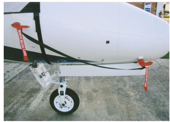
Citation XL Pitot Covers