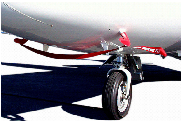
Cessna Citation I Pitot Covers