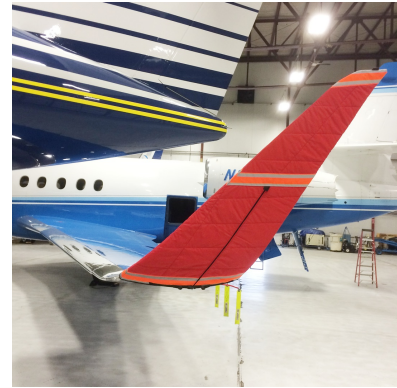
Falcon 2000 Winglet Pad