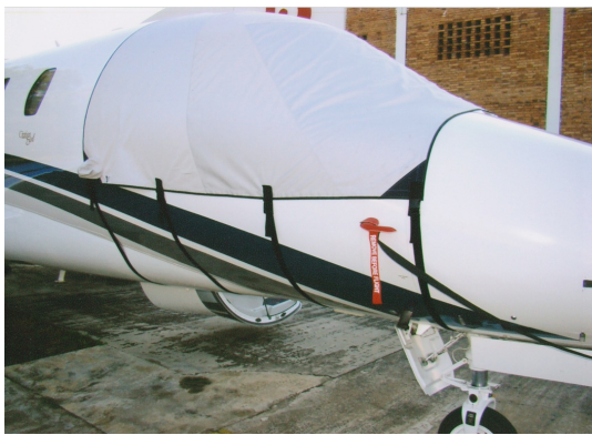
Citation XL Cockpit Cover