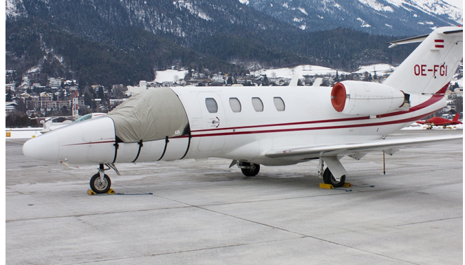
Cessna Citationjet CJ1 Cockpit Cover