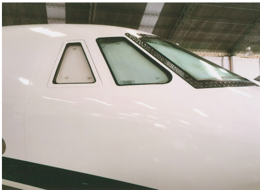
Citation XL Cockpit HeatShields

Cockpit Heatshields are interior sunshades for the aircraft's cockpit. The product is a unique composite of closed-cell foam with a silver mylar finish. The semi-rigid design is stiff enough to stand inside the window framing. The set folds up flat and is easily stored in the included storage sleeve. Some designs may require velcro and suction cups. Our Heatshields for jets are offered white side out because some aircraft manufacturers have issued advisories against reflective window inserts due to potential heat damage. A Heatshield is an excellent short-term remedy for cockpit overheating, but an external fabric cover is more effective for long-term protection.