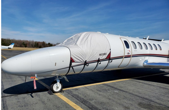
Cessna Citation 560 Cockpit Cover

This cover type is made from Silver Acrylic Sunbrella canvas and is 100% lined with a soft and smooth microfiber. Bruce's Custom Covers developed this material combination especially for aircraft protection. The outer material is medium weight and treated for water resistance, UV resistance and anti-static buildup. The inner lining is a very soft and smooth microfiber to prevent scratching. The material is very reflective, and tests show that the cabin interior temperature can be reduced to near-ambient temperature on the hottest of days. It is water, ice and snow repellent, yet breathable to allow moisture to escape from between the cover and the aircraft surface.