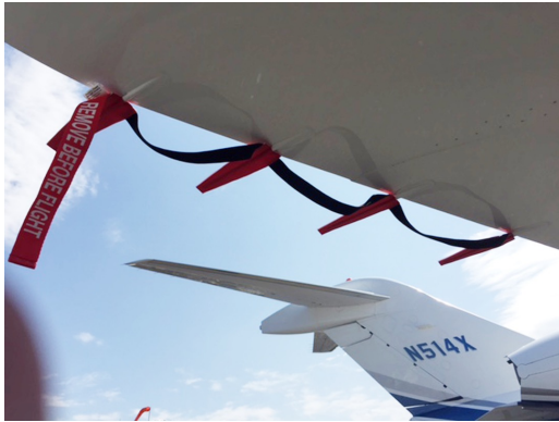
Citation X Static Wick Protectors

ALL-YEAR USE MATERIAL - Made with Silver Acrylic Sunbrella canvas, the all-year use material is the best option for sun protection and cover longevity. This heavier more durable material is intended for all weather conditions, such as rain and snow or lots of sun.