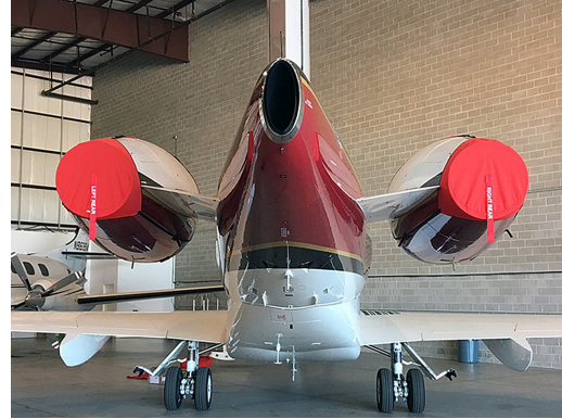
Canadair Challenger 300 Intake/Exhaust Covers, 3-Strap Type