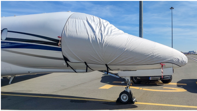
Cessna Citation Latitude (680A) Cockpit/Nose Cover, Doesn't Cover Pitot Tubes