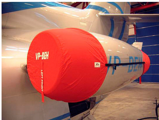
Falcon 900 Sovereign Engine Covers

The Cessna Citation Latitude (680A) Intake/Exhaust Plugs are custom fit for the intake and exhaust openings, made with heavy-duty vinyl material, and stuffed with a single block of sculpted urethane foam. Each plug has a zipper that allows the foam to be removed and dried if necessary. Engine plugs have 'remove before flight' streamers sewn onto the face of the plugs. Most plugs are imprinted with the aircraft registration number in black. Engine plugs may be inserted after flight when the engine is still warm. Engine Inlet Plugs are commonly referred to as Cowl Plugs, Intake Plugs, Cowl Blocks, Engine Blocks, and Engine Bungs.