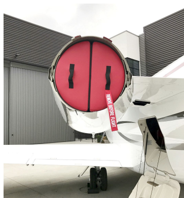
Cessna Citation 680 Exhaust Plugs, folding type