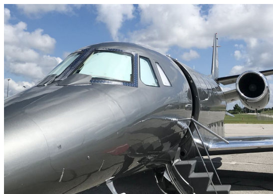
Cessna Citation 560XL Cockpit HeatShields