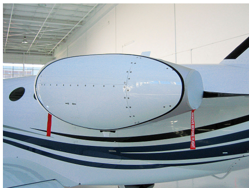
Cessna 510 Mustang Bikini Type Engine Cover