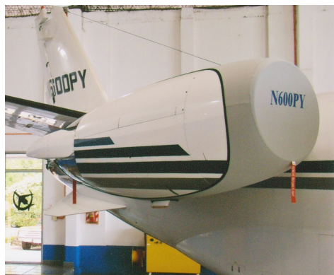
Citation XL Bikini Style Engine Covers

The Cessna Citation VII (650) Intake/Exhaust Plugs are custom fit for the intake and exhaust openings, made with heavy-duty vinyl material, and stuffed with a single block of sculpted urethane foam. Each plug has a zipper that allows the foam to be removed and dried if necessary. Engine plugs have 'remove before flight' streamers sewn onto the face of the plugs. Most plugs are imprinted with the aircraft registration number in black. Engine plugs may be inserted after flight when the engine is still warm. Engine Inlet Plugs are commonly referred to as Cowl Plugs, Intake Plugs, Cowl Blocks, Engine Blocks, and Engine Bungs.