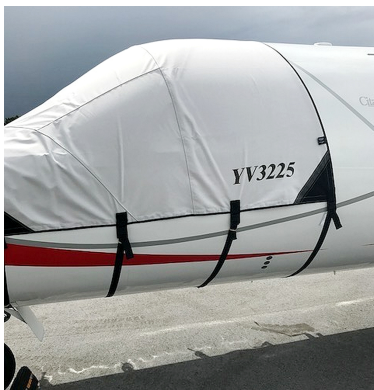
Cessna Citationjet V Ultra (560) Cockpit Cover