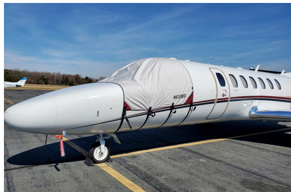
Cessna Citation 560 Cockpit Cover