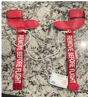
Cessna Citation Pitot Cover Set

The Engine Inlet Plugs are custom fit for your Cessna Citation VII (650) intakes, made with heavy-duty vinyl material, and stuffed with a single block of sculpted urethane foam. Each plug has a zipper that allows the foam to be removed and dried if necessary. Engine plugs have 'remove before flight' streamers sewn onto the face of the plugs. Most plugs are imprinted with the aircraft registration number in black for an extra charge. Storage bag NOT included. Engine plugs may be inserted after flight when the engine is still warm. Engine Inlet Plugs are commonly referred to as Cowl Plugs, Intake Plugs, Cowl Blocks, Engine Blocks, and Engine Bungs.