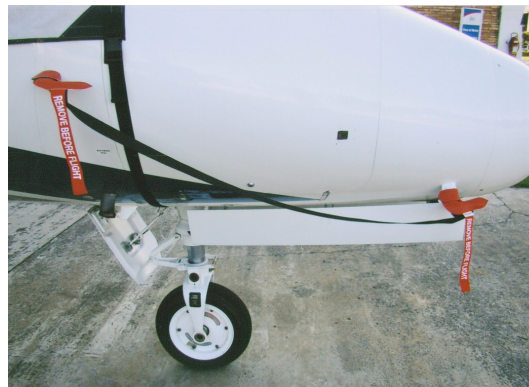
Citation XL Pitot Covers