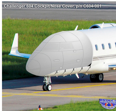
Challenger 601/604 Cockpit/Nose Cover, illustration

This cover type is made from Silver Acrylic Sunbrella canvas and is 100% lined with a soft and smooth microfiber. Bruce's Custom Covers developed this material combination especially for aircraft protection. The outer material is medium weight and treated for water resistance, UV resistance and anti-static buildup. The inner lining is a very soft and smooth microfiber to prevent scratching. The material is very reflective, and tests show that the cabin interior temperature can be reduced to near-ambient temperature on the hottest of days. It is water, ice and snow repellent, yet breathable to allow moisture to escape from between the cover and the aircraft surface.