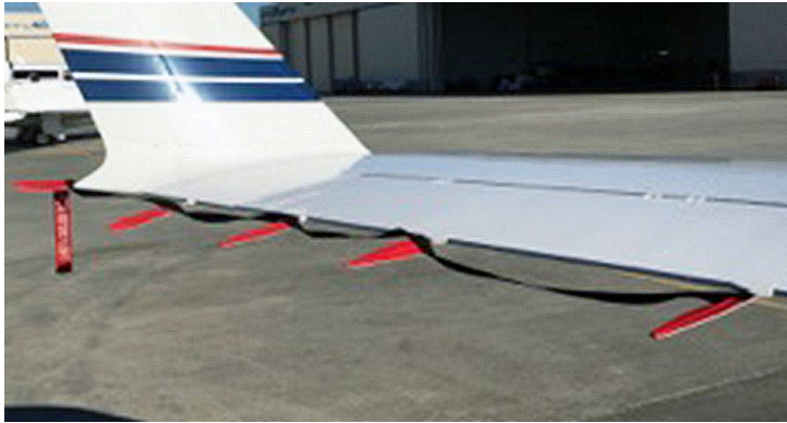
Static Wick Covers

with the aircraft registration number in black for an extra charge. Storage bag NOT included. Engine plugs may be inserted after flight when the engine is still warm. Engine Inlet Plugs are commonly referred to as Cowl Plugs, Intake Plugs, Cowl Blocks, Engine Blocks, and Engine Bungs.