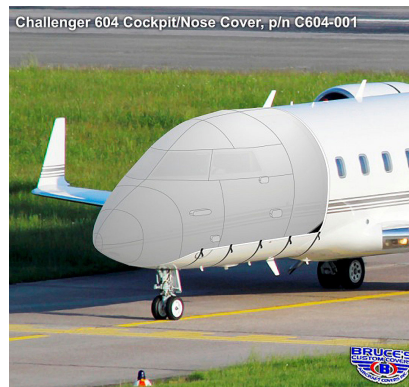
Challenger 601/604 Cockpit/Nose Cover, illustration

This cover type is made from Silver Acrylic Sunbrella canvas and is 100% lined with a soft and smooth microfiber. Bruce's Custom Covers developed this material combination especially for aircraft protection. The outer material is medium weight and treated for water resistance, UV resistance and anti-static buildup. The inner lining is a very soft and smooth microfiber to prevent scratching. The material is very reflective, and tests show that the cabin interior temperature can be reduced to near-ambient temperature on the hottest of days. It is water, ice and snow repellent, yet breathable to allow moisture to escape from between the cover and the aircraft surface.