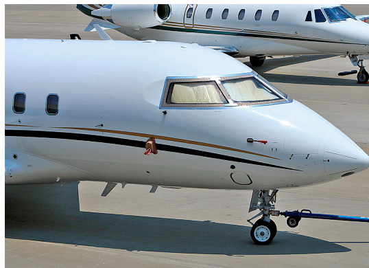
Challenger 604 Cockpit HeatShields