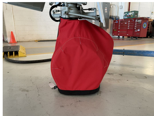
Canadair Challenger 605 Nose Gear Tire Cover