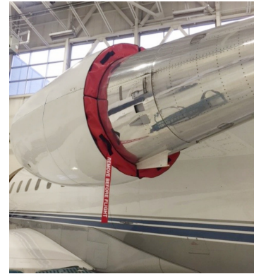
Canadair Challenger 604 Bypass Plugs