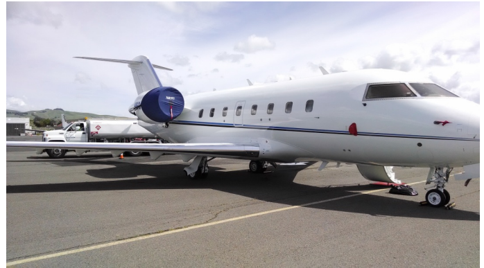
Challenger 604 Intake Covers