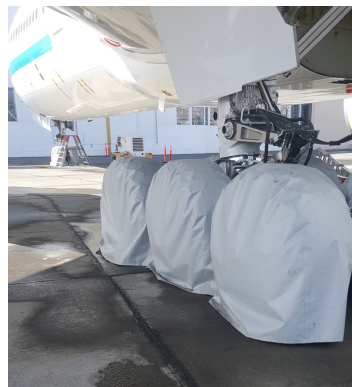
Boeing 777 Main & Nose Gear Tire Covers