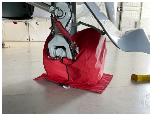
Canadair Challenger 605 Main Gear Tire Covers