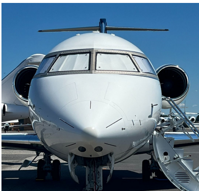
Bombardier CL-600-2B16 Cockpit Heatshields