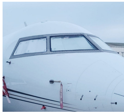
Challenger 604 Cockpit Heatshields (set of 4)