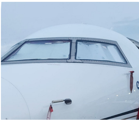
Challenger 604 Cockpit Heatshields (set of 4)