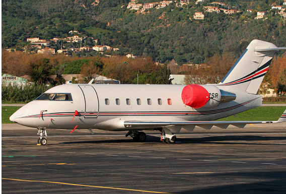
Challenger 601 Intake Covers, standard design

The Canadair Challenger 604, 605, 650, 850 Intake Covers are designed to install easily yet be completely storable. A spring steel hoop is sewn into the hem of each cover, allowing them to be installed without climbing onto the wing or using a stepladder. To store the covers the spring steel hoop folds like a band-saw blade into three nesting rings. Each cover folds into a compact circular bundle which is stored in the included duffel bag, yet they unfold quickly for use. The Tri-Fold Ring cover is made of medium weight nylon which is available in a variety of colors to match the paint trim. Each cover set comes complete with installation and folding instructions. The aircraft's registration number can be silkscreened onto the cover for an extra charge.