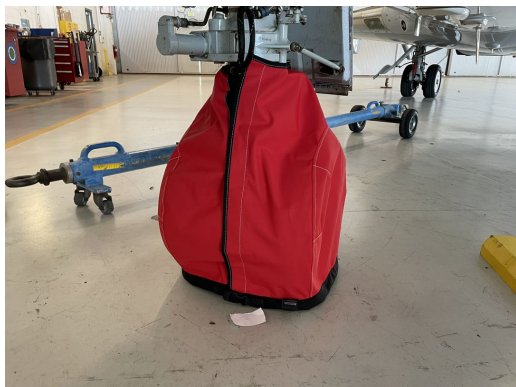
Canadair Challenger 605 Nose Gear Tire Cover

ALL-YEAR USE MATERIAL - Made with Silver Acrylic Sunbrella canvas, the all-year use material is the best option for sun protection and cover longevity. This heavier more durable material is intended for all weather conditions, such as rain and snow or lots of sun.