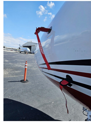
Canadair Challenger 601 Pitot Covers, Heat Resistant Type