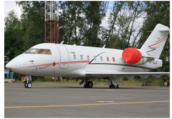
Canadair Challenger 601 Intake Covers