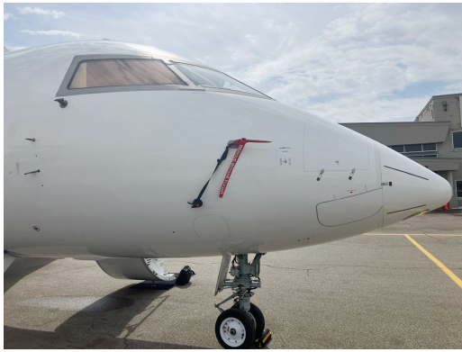
Challenger 650 Pitot & Ice Detector Covers