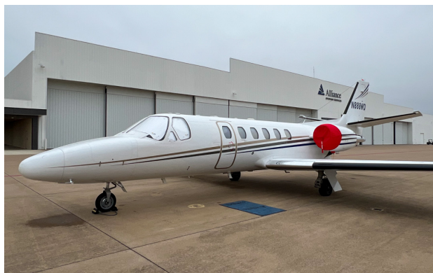
Cessna 550 Intake Covers & Exhaust Plugs, includes wedge plug for nacelle recommended (set of 6)

The Cessna Citation II Bravo Intake/Exhaust Plugs are custom fit for the intake and exhaust openings, made with heavy-duty vinyl material, and stuffed with a single block of sculpted urethane foam. Each plug has a zipper that allows the foam to be removed and dried if necessary. Engine plugs have 'remove before flight' streamers sewn onto the face of the plugs. Most plugs are imprinted with the aircraft registration number in black. Engine plugs may be inserted after flight when the engine is still warm. Engine Inlet Plugs are commonly referred to as Cowl Plugs, Intake Plugs, Cowl Blocks, Engine Blocks, and Engine Bungs.