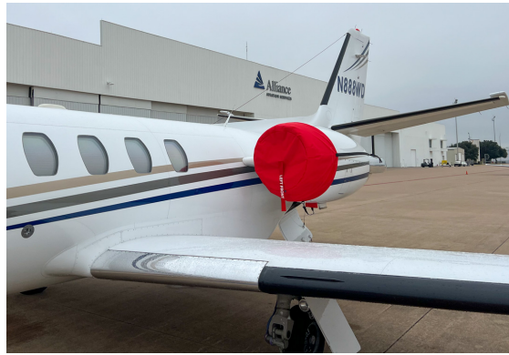
Cessna Citation Engine Cover Set Cessna 550 Intake Covers & Exhaust Plugs, includes wedge plug for nacelle recommended (set of 6)