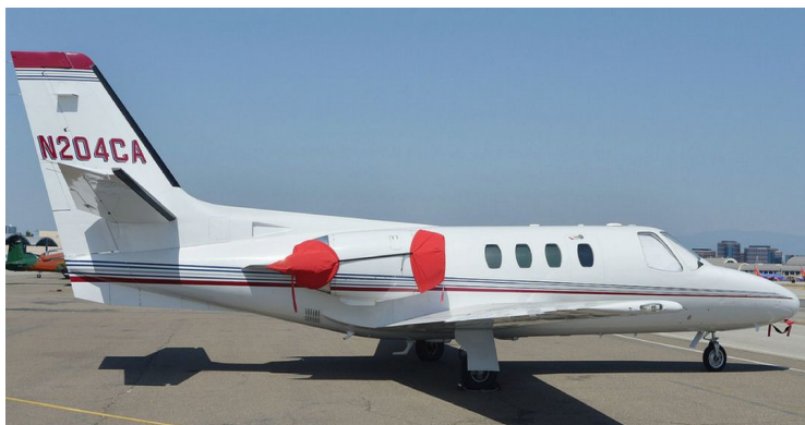
Cessna Citation Engine Covers and Heatshields