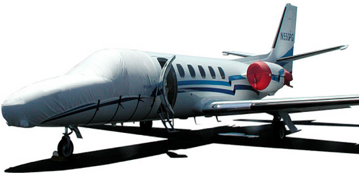
Cessna Citation Windshield Cover, Engine Cover set and Pitot Covers