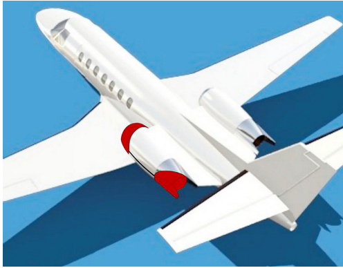
Cessna Citation II with TR's Exhaust Cover Illustration

The Cessna Citationjet V Ultra & Encore Models Intake/Exhaust Plugs are custom fit for the intake and exhaust openings, made with heavy-duty vinyl material, and stuffed with a single block of sculpted urethane foam. Each plug has a zipper that allows the foam to be removed and dried if necessary. Engine plugs have 'remove before flight' streamers sewn onto the face of the plugs. Most plugs are imprinted with the aircraft registration number in black. Engine plugs may be inserted after flight when the engine is still warm. Engine Inlet Plugs are commonly referred to as Cowl Plugs, Intake Plugs, Cowl Blocks, Engine Blocks, and Engine Bungs.