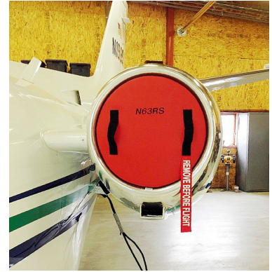
Cessna Citation S2 Intake Plugs