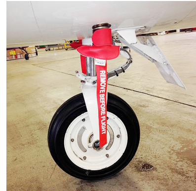
Rosemount Probe Cover