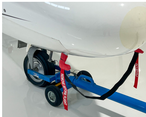
Cessna Citationjet V Ultra (560) Exhaust Plugs