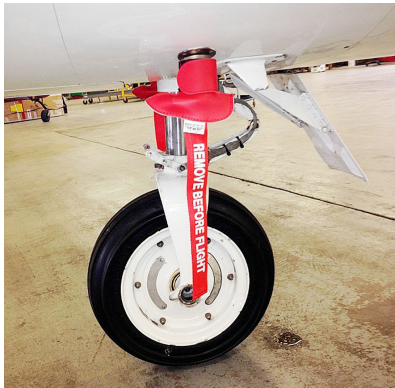
Rosemount Probe Cover

The Engine Inlet Plugs are custom fit for your Cessna Citationjet V Ultra & Encore Models intakes, made with heavy-duty vinyl material, and stuffed with a single block of sculpted urethane foam. Each plug has a zipper that allows the foam to be removed and dried if necessary. Engine plugs have 'remove before flight' streamers sewn onto the face of the plugs. Most plugs are imprinted with the aircraft registration number in black for an extra charge. Storage bag NOT included. Engine plugs may be inserted after flight when the engine is still warm. Engine Inlet Plugs are commonly referred to as Cowl Plugs, Intake Plugs, Cowl Blocks, Engine Blocks, and Engine Bungs.