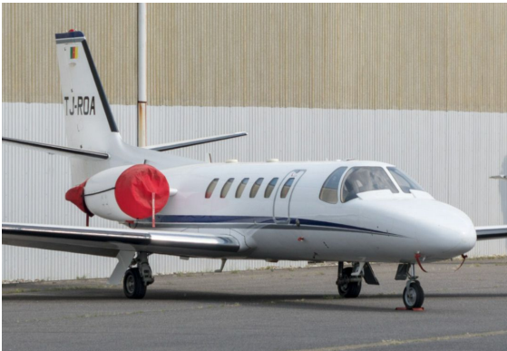
Cessna Citation II Bravo Engine Covers

The Cessna Citationjet V Ultra & Encore Models Intake/Exhaust Plugs are custom fit for the intake and exhaust openings, made with heavy-duty vinyl material, and stuffed with a single block of sculpted urethane foam. Each plug has a zipper that allows the foam to be removed and dried if necessary. Engine plugs have 'remove before flight' streamers sewn onto the face of the plugs. Most plugs are imprinted with the aircraft registration number in black. Engine plugs may be inserted after flight when the engine is still warm. Engine Inlet Plugs are commonly referred to as Cowl Plugs, Intake Plugs, Cowl Blocks, Engine Blocks, and Engine Bungs.