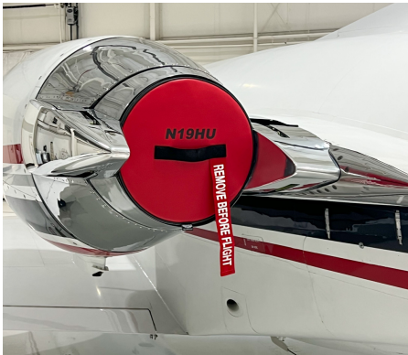
Cessna Citationjet V Ultra (560) Exhaust Plugs