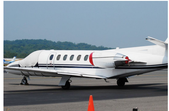
Cessna 551 Citation II SP Engine covers (with thrust reversers, smooth gen. inlet)