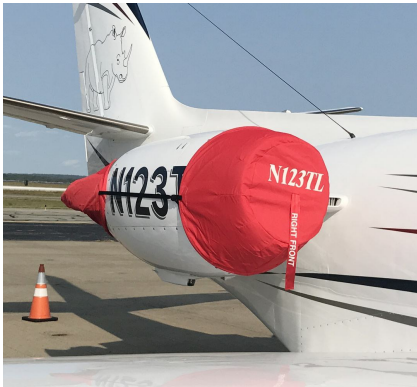
Cessna Citation S/II (S550) Engine Covers (With Tr's)

The Cessna Citation II (550, 551, UC-35A, with JT15D) Intake Covers are designed to install easily yet be completely storable. A spring steel hoop is sewn into the hem of each cover, allowing them to be installed without climbing onto the wing or using a stepladder. To store the covers the spring steel hoop folds like a band-saw blade into three nesting rings. Each cover folds into a compact circular bundle which is stored in the included duffle bag, yet they unfold quickly for use. The Tri-Fold Ring cover is made of medium weight nylon which is available in a variety of colors to match the paint trim. Each cover set comes complete with installation and folding instructions. The aircraft's registration number can be silkscreened onto the cover for an extra charge.