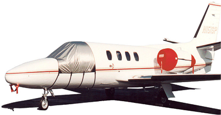
Cessna Citation Windshield, Pitot and Engine Covers