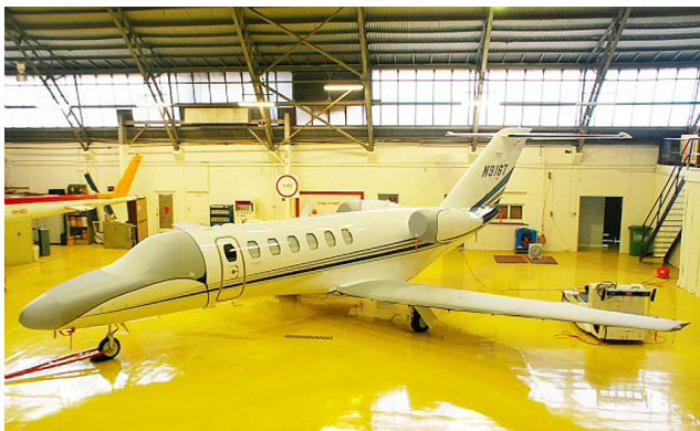
Cessna Citationjet CJ3 Cockpit/Nose, Engine &amp; Wings Travel Covers

WINTER USE MATERIAL - Made with Solution-Dyed Polyester fabric, this option is intended for seasonal use to aid in deicing, rain mitigation, or for occasional travel. The material is lighter and more compact, but more susceptible to UV damage and may have a shorter useful life if used continuously outside than the all-year use material.