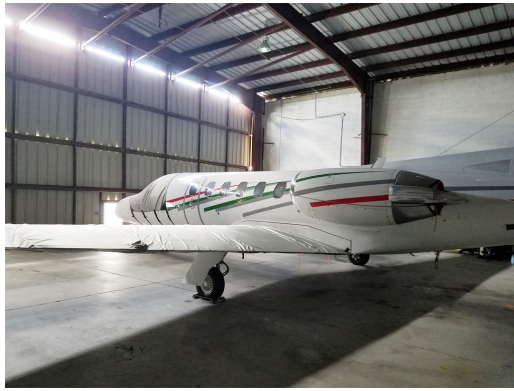
Cessna Citation II Cockpit Cover, Wing Covers