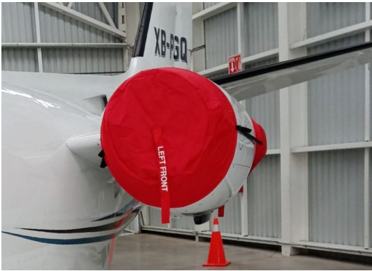
Cessna 551 Citation II SP Engine covers (with thrust reversers, smooth gen. inlet)