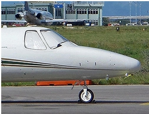
Cessna Citation S550 Cockpit HeatShields

Custom-made Heatshield Sunshades are available for almost any window in the jet. Side windows, Skylights, and Emergency Exits are all custom-made. The product is a unique composite of closed-cell foam with a silver mylar finish. The set is easily stored in the included storage sleeve. Some designs may require velcro and suction cups. Our Heatshields are offered white side out since aircraft manufacturers have issued advisories against reflective window inserts due to potential heat damage.