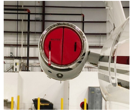
Embraer Legacy 500 Engine Inlet Plugs, folding type