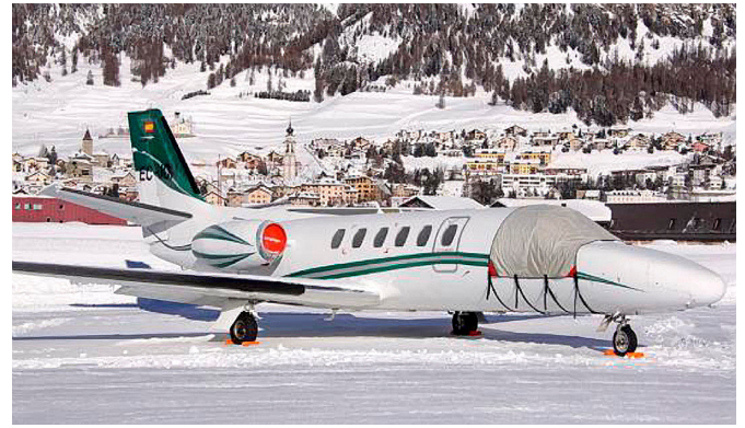
Cessna Citation 550 Windshield Cover