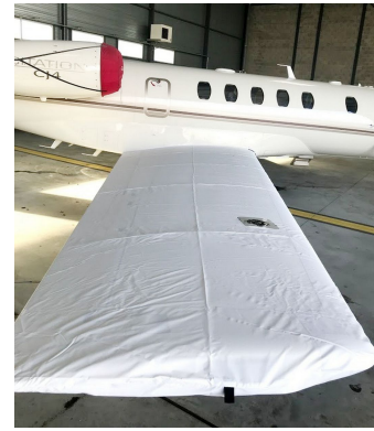
Cessna Citation CJ-4 Wing Covers, test fit cover