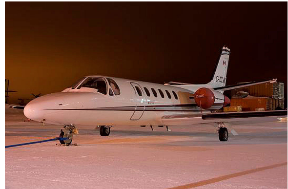
Cessna Citation 550 Engine Cover Set