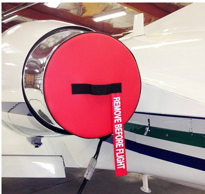
Cessna Citation S2 Exhaust Plugs

The Engine Inlet Plugs are custom fit for your Cessna Citation II (550, 551, UC-35A, with JT15D) intakes, made with heavy-duty vinyl material, and stuffed with a single block of sculpted urethane foam. Each plug has a zipper that allows the foam to be removed and dried if necessary. Engine plugs have 'remove before flight' streamers sewn onto the face of the plugs. Most plugs are imprinted with the aircraft registration number in black for an extra charge. Storage bag NOT included. Engine plugs may be inserted after flight when the engine is still warm. Engine Inlet Plugs are commonly referred to as Cowl Plugs, Intake Plugs, Cowl Blocks, Engine Blocks, and Engine Bungs.