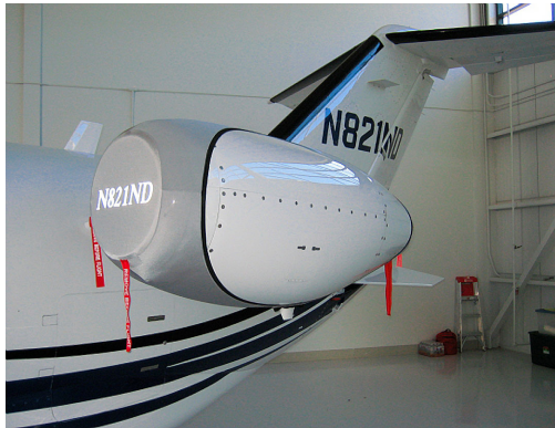
Cessna 510 Mustang Bikini Type Engine Cover

The Cessna Citation II (550, 551, UC-35A, with JT15D) Intake Covers are designed to install easily yet be completely storable. A spring steel hoop is sewn into the hem of each cover, allowing them to be installed without climbing onto the wing or using a stepladder. To store the covers the spring steel hoop folds like a band-saw blade into three nesting rings. Each cover folds into a compact circular bundle which is stored in the included duffle bag, yet they unfold quickly for use. The Tri-Fold Ring cover is made of medium weight nylon which is available in a variety of colors to match the paint trim. Each cover set comes complete with installation and folding instructions. The aircraft's registration number can be silkscreened onto the cover for an extra charge.