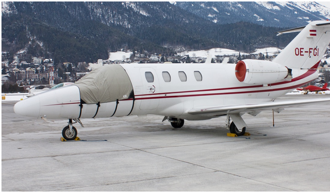
Cessna Citationjet CJ1 Cockpit Cover

This cover type is made from Silver Acrylic Sunbrella canvas and is 100% lined with a soft and smooth microfiber. Bruce's Custom Covers developed this material combination especially for aircraft protection. The outer material is medium weight and treated for water resistance, UV resistance and anti-static buildup. The inner lining is a very soft and smooth microfiber to prevent scratching. The material is very reflective, and tests show that the cabin interior temperature can be reduced to near-ambient temperature on the hottest of days. It is water, ice and snow repellent, yet breathable to allow moisture to escape from between the cover and the aircraft surface.