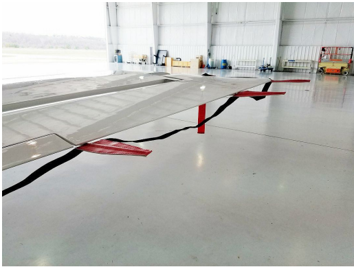
Hawker Beechcraft 800, 800XP, 850XP Static Wick Protectors