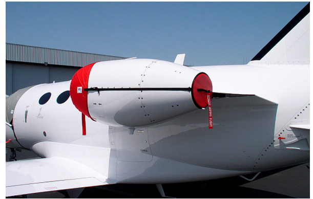
Citation Mustang Intake/Exhaust Cover, "Bikini" Type and leading edge Pylon inlet plugs