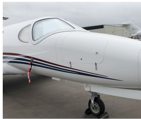
Cessna Mustang 510 Cockpit Heatshields, Pitot Cover/AOA