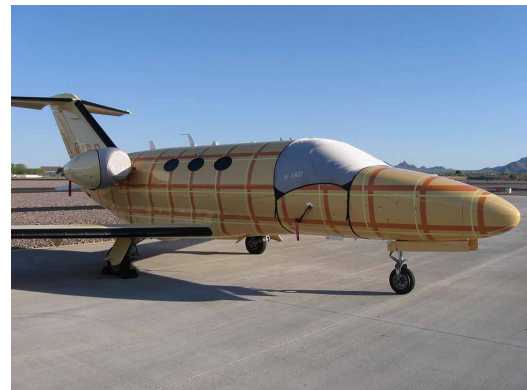
Cessna 510 Mustang Cockpit/Nose Cover, Engine Inlet Plugs