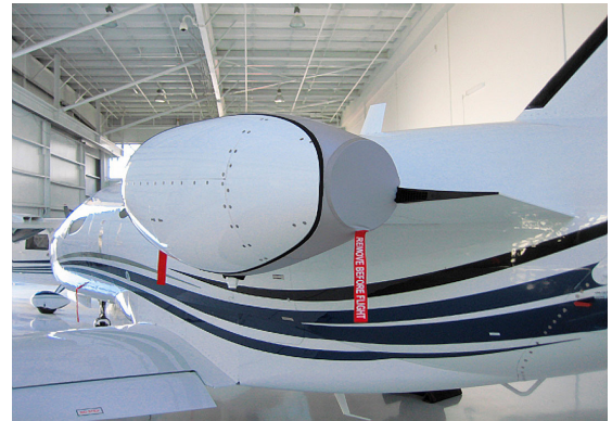
Citation Mustang Intake/Exhaust Cover, "Bikini" Type and leading edge Pylon inlet plugs