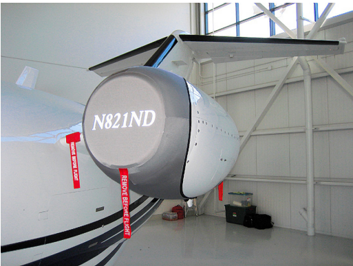
Citation Mustang Intake/Exhaust Cover, "Bikini" Type and leading edge Pylon inlet plugs