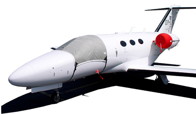
Citation Mustang Windshield Cover, Intake Cover/Exhaust Plug Set, Pitot Covers

Travel Covers are made with Silver Solution-Dyed Polyester fabric and only lined over the windshield to save weight. The material is lightweight and more compact for easy stowage in the aircraft. The polyester material is water resistant, but only intended for occasional use outside. We also have an ultra lightweight material available for fitted hangar dust covers. For daily outdoor use, the non-travel Sunbrella Cover is the best choice.