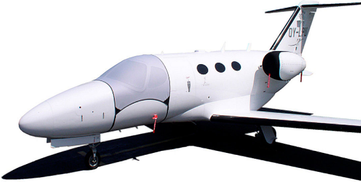
Citation Mustang Light Weight Travel Windshield Cover, "Bikini" type Engine Cover Set

Travel Covers are made with Silver Solution-Dyed Polyester fabric and only lined over the windshield to save weight. The material is lightweight and more compact for easy stowage in the aircraft. The polyester material is water resistant, but only intended for occasional use outside. We also have an ultra lightweight material available for fitted hangar dust covers. For daily outdoor use, the non-travel Sunbrella Cover is the best choice.