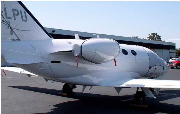
Citation Mustang Light Weight Engine Cover, Light Weight Windshield Cover, Pitot/AOA Cover

The Cessna Mustang 510 Intake/Exhaust Plugs are custom fit for the intake and exhaust openings, made with heavy-duty vinyl material, and stuffed with a single block of sculpted urethane foam. Each plug has a zipper that allows the foam to be removed and dried if necessary. Engine plugs have 'remove before flight' streamers sewn onto the face of the plugs. Most plugs are imprinted with the aircraft registration number in black. Engine plugs may be inserted after flight when the engine is still warm. Engine Inlet Plugs are commonly referred to as Cowl Plugs, Intake Plugs, Cowl Blocks, Engine Blocks, and Engine Bungs.