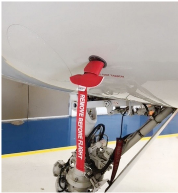
Grumman Gulfstream G-V Rosemont/TAT Cover

Designed to prevent damage to the aircraft extremities in crowded hangars, these products are made of bright red Naugahyde and thickly padded with a sandwich of closed cell foam.