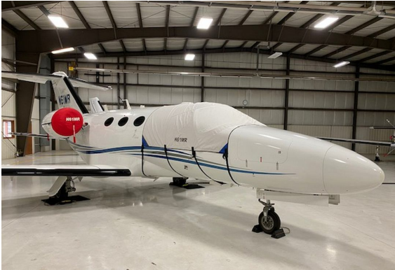
Cessna 510 Cockpit Cover extends to cover door