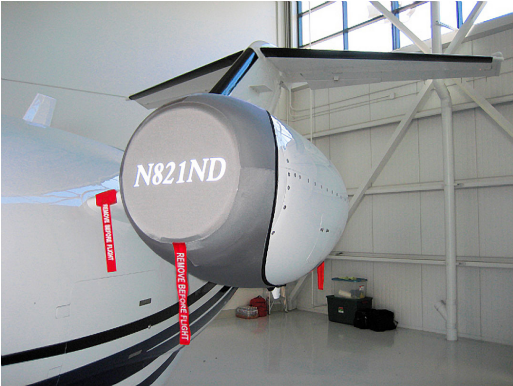
Citation Mustang Intake/Exhaust Cover, "Bikini" Type and leading edge Pylon inlet plugs

The Cessna Mustang 510 Intake/Exhaust Plugs are custom fit for the intake and exhaust openings, made with heavy-duty vinyl material, and stuffed with a single block of sculpted urethane foam. Each plug has a zipper that allows the foam to be removed and dried if necessary. Engine plugs have 'remove before flight' streamers sewn onto the face of the plugs. Most plugs are imprinted with the aircraft registration number in black. Engine plugs may be inserted after flight when the engine is still warm. Engine Inlet Plugs are commonly referred to as Cowl Plugs, Intake Plugs, Cowl Blocks, Engine Blocks, and Engine Bungs.