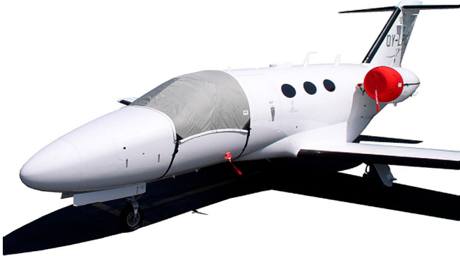
Citation Mustang Windshield Cover, Intake Cover/Exhaust Plug Set, Pitot Covers