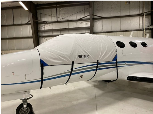
Cessna 510 Cockpit Cover extends to cover door

This cover type is made from Silver Acrylic Sunbrella canvas and is 100% lined with a soft and smooth microfiber. Bruce's Custom Covers developed this material combination especially for aircraft protection. The outer material is medium weight and treated for water resistance, UV resistance and anti-static buildup. The inner lining is a very soft and smooth microfiber to prevent scratching. The material is very reflective, and tests show that the cabin interior temperature can be reduced to near-ambient temperature on the hottest of days. It is water, ice and snow repellent, yet breathable to allow moisture to escape from between the cover and the aircraft surface.