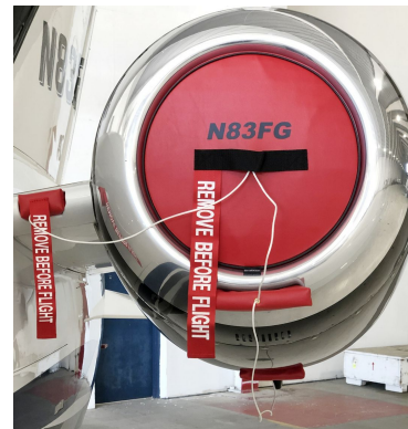
Cessna Citation Mustang 510 Engine Plugs