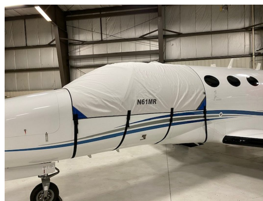
Cessna 510 Cockpit Cover extends to cover door