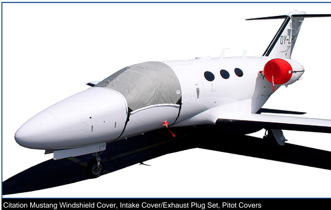
Citation Mustang Windshield Cover, Intake Cover/Exhaust Plug Set, Pitot Covers