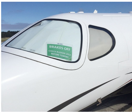
Cessna Mustang 510 Cockpit Heatshields