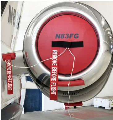
Cessna Citation Mustang 510 Engine Plugs

The Engine Inlet Plugs are custom fit for your Cessna Mustang 510 intakes, made with heavy-duty vinyl material, and stuffed with a single block of sculpted urethane foam. Each plug has a zipper that allows the foam to be removed and dried if necessary. Engine plugs have 'remove before flight' streamers sewn onto the face of the plugs. Most plugs are imprinted with the aircraft registration number in black for an extra charge. Storage bag NOT included. Engine plugs may be inserted after flight when the engine is still warm. Engine Inlet Plugs are commonly referred to as Cowl Plugs, Intake Plugs, Cowl Blocks, Engine Blocks, and Engine Bungs.