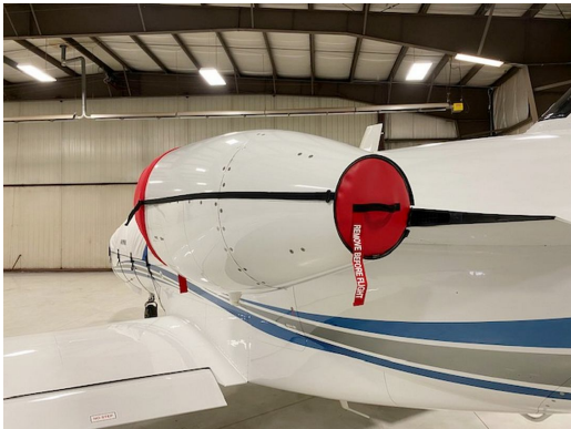
Cessna 510 Engine Inlet Covers & Exhaust Plugs

The Engine Inlet Plugs are custom fit for your Cessna Mustang 510 intakes, made with heavy-duty vinyl material, and stuffed with a single block of sculpted urethane foam. Each plug has a zipper that allows the foam to be removed and dried if necessary. Engine plugs have 'remove before flight' streamers sewn onto the face of the plugs. Most plugs are imprinted with the aircraft registration number in black for an extra charge. Storage bag NOT included. Engine plugs may be inserted after flight when the engine is still warm. Engine Inlet Plugs are commonly referred to as Cowl Plugs, Intake Plugs, Cowl Blocks, Engine Blocks, and Engine Bungs.