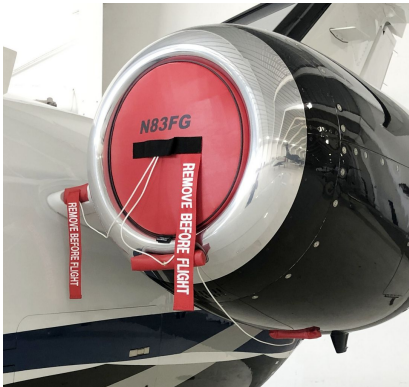
Cessna Mustang 510 Engine Inlet Plugs, Includes Intercooler Intake & Exhaust And Gen. Plugs