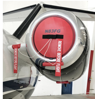
Cessna Mustang 510 Engine Inlet Plugs, Includes Intercooler Intake &amp; Exhaust And Gen. Plugs