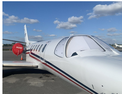
Cessna Citation S550