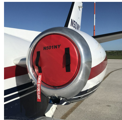
Citation 501 Intake/Exhaust Plug Set