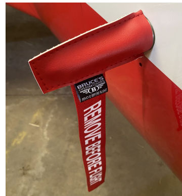
Cessna 501 Angle of Attack Transducer Cover