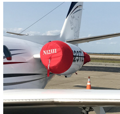
Cessna Citation S/II (S550) Engine Covers (With Tr's)