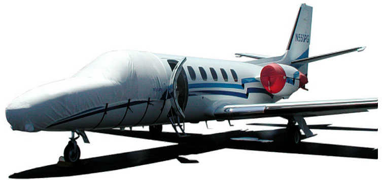
Cessna Citation Nose/Cockpit Cover, Engine Covers