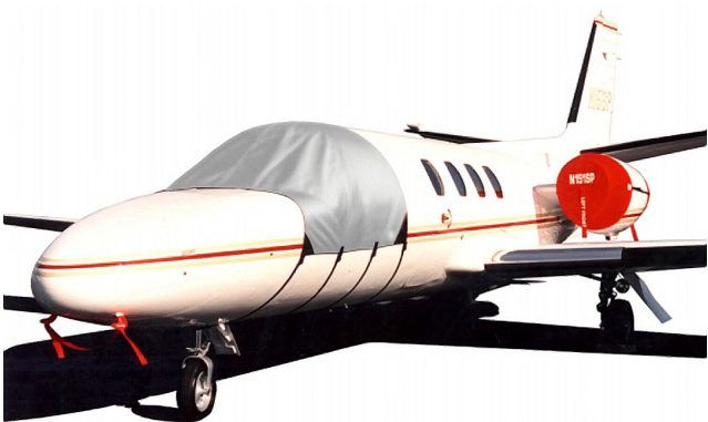
Cessna Citationjet 525B Travel Weight Cockpit/Nose Cover Cessna Citation Windshield Cover, Engine Cover set and Pitot Covers