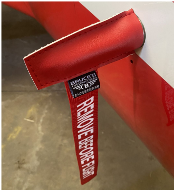
Cessna 501 Angle of Attack Transducer Cover