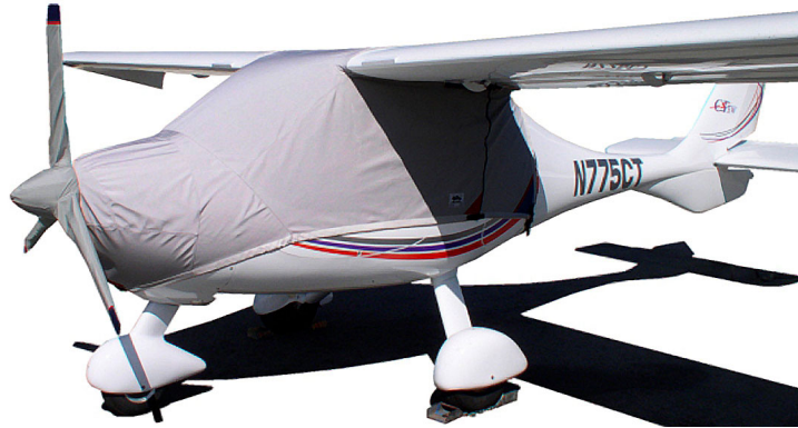
Flight Design CT Canopy/Engine Cover

Travel Covers are made with Silver Solution-Dyed Polyester fabric and only lined over the windshield to save weight. The material is lightweight and more compact for easy stowage in the aircraft. The polyester material is water resistant, but only intended for occasional use outside. We also have an ultra lightweight material available for fitted hangar dust covers. For daily outdoor use, the non-travel Sunbrella Cover is the best choice.