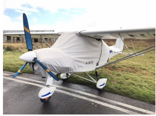
Ikarus C-42 Extended Canopy/Engine Cover