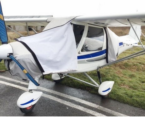
Ikarus C-42 Extended Canopy/Engine Cover