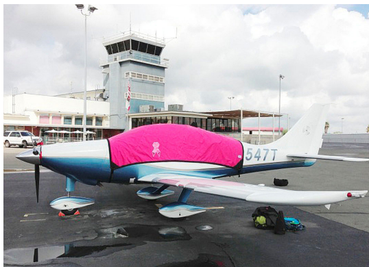
Cessna Corvalis Canopy Cover (Pink Cover Program)

This cover type is made from Silver Acrylic Sunbrella canvas and is 100% lined with a soft and smooth microfiber. Bruce's Custom Covers developed this material combination especially for aircraft protection. The outer material is medium weight and treated for water resistance, UV resistance and anti-static buildup. The inner lining is a very soft and smooth microfiber to prevent scratching. The material is very reflective, and tests show that the cabin interior temperature can be reduced to near-ambient temperature on the hottest of days. It is water, ice and snow repellent, yet breathable to allow moisture to escape from between the cover and the aircraft surface.