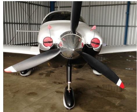
Columbia 350 Engine Plugs