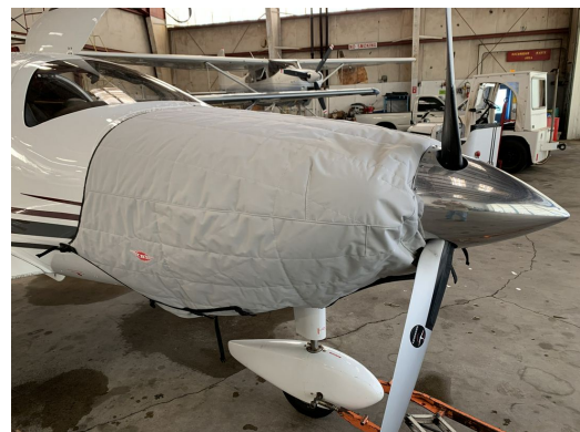
Cessna Corvalis Insulated Engine Cover