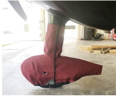
Cessna Corvalis, Lancair Columbia Wheelpant & Strut Cover