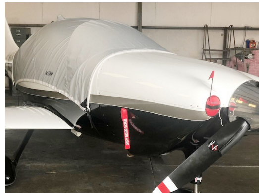
Columbia 350 Travel Cover, Engine Plugs