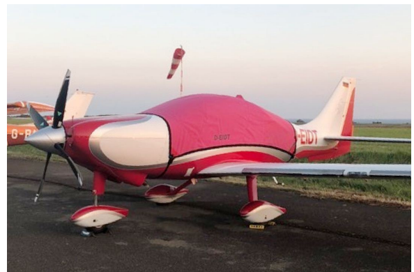
Columbia 400 Pink Canopy Cover