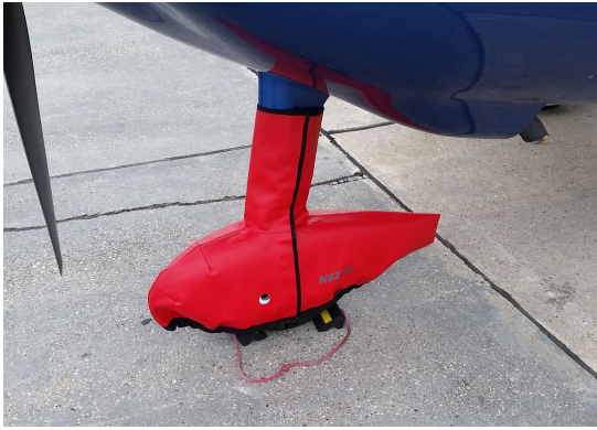
Lancair Columbia Nose Wheelpant/Strut Cover

protection and cover longevity. This heavier more durable material is intended for all weather conditions, such as rain and snow or lots of sun.