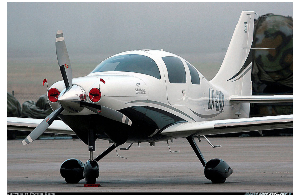
Cessna Corvalis Engine Plugs