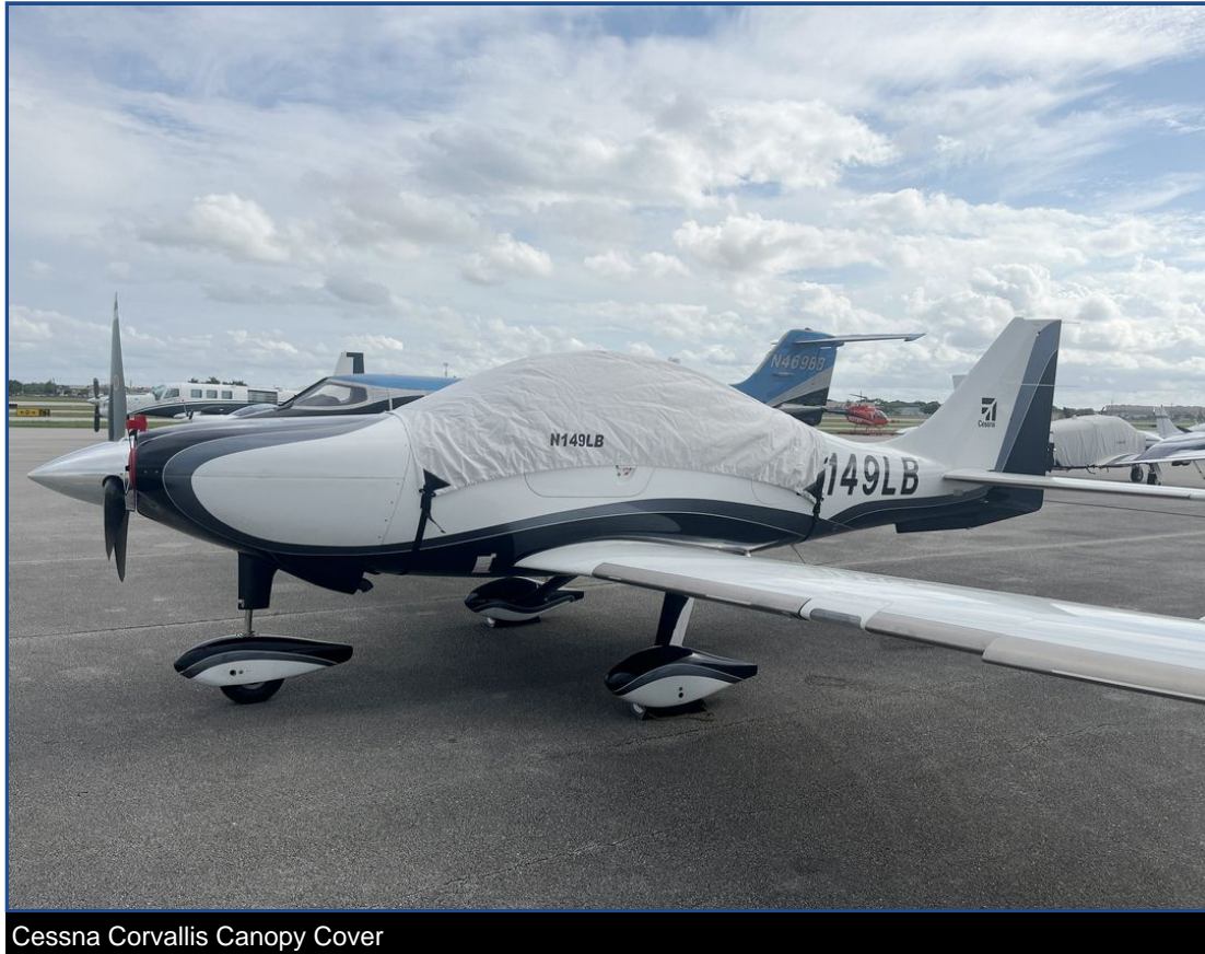
Cessna Corvallis Canopy Cover