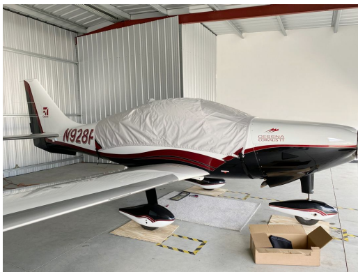
Corvalis TT 400 Canopy Cover

This cover type is made from Silver Acrylic Sunbrella canvas and is 100% lined with a soft and smooth microfiber. Bruce's Custom Covers developed this material combination especially for aircraft protection. The outer material is medium weight and treated for water resistance, UV resistance and anti-static buildup. The inner lining is a very soft and smooth microfiber to prevent scratching. The material is very reflective, and tests show that the cabin interior temperature can be reduced to near-ambient temperature on the hottest of days. It is water, ice and snow repellent, yet breathable to allow moisture to escape from between the cover and the aircraft surface.