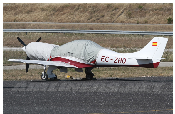
Lancair 360 Canopy Cover, Engine Cover