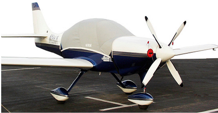
Lancair ES Canopy Cover

Engine Inlet Plugs are custom fit for your Cessna Corvalis, Corvalis TT, Models T240, 350 & 400 intakes, made with heavy-duty vinyl material, and stuffed with a single block of sculpted urethane foam. Each plug has a zipper that allows the foam to be removed and dried if necessary. Engine plugs have warning flags that are visible from the cockpit or 'remove before flight' streamers sewn onto the face of the plugs. Most plugs are imprinted with the aircraft registration number in black for an extra charge. Storage bag NOT included. Engine plugs may be inserted after flight when the engine is still warm. Engine Inlet Plugs are commonly referred to as Cowl Plugs, Intake Plugs, Cowl Blocks, Engine Blocks, and Engine Bung s. Designed to prevent damage to the aircraft extremities in crowded hangars, these products are made of bright red Naugahyde and thickly padded with a sandwich of closed cell foam.