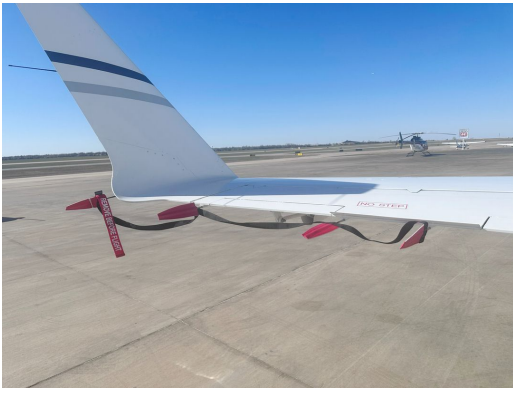
Canadair Challenger 300 Static Wick Covers