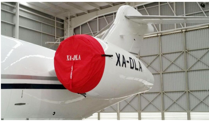
Challenger 300 Intake Covers