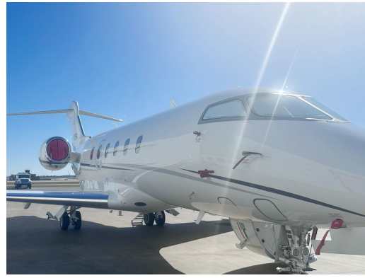
Canadair Challenger 300 Cockpit HeatShields, Intake Plugs