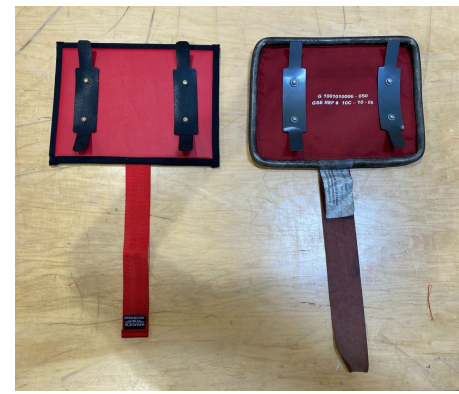
Canadair Challenger 300, 350 APU Intake Cover