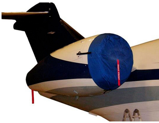
Challenger 300 Intake Covers (set of 2), come in colors