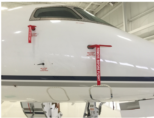
Challenger 300 Pitot Covers