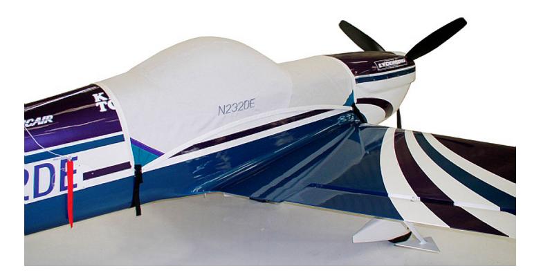
Cap 232 Canopy Cover