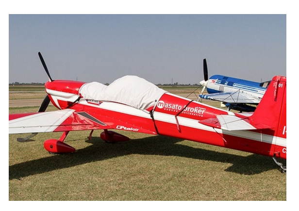
Mudry Cap 231 Canopy Cover

Extra 300SC with NASCAR style custom cover