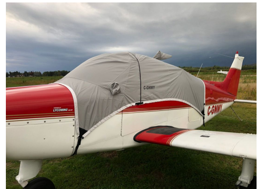
Beech Sundowner Travel Canopy Cover