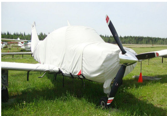
Beech Sierra Engine, Extended Canopy, Empennage, & Wing Covers

This cover type is made from Silver Acrylic Sunbrella canvas and is 100% lined with a soft and smooth microfiber. Bruce's Custom Covers developed this material combination especially for aircraft protection. The outer material is medium weight and treated for water resistance, UV resistance and anti-static buildup. The inner lining is a very soft and smooth microfiber to prevent scratching. The material is very reflective, and tests show that the cabin interior temperature can be reduced to near-ambient temperature on the hottest of days. It is water, ice and snow repellent, yet breathable to allow moisture to escape from between the cover and the aircraft surface.