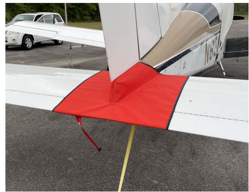
Beech C23 Tailcone Cover, Fully Enclosed