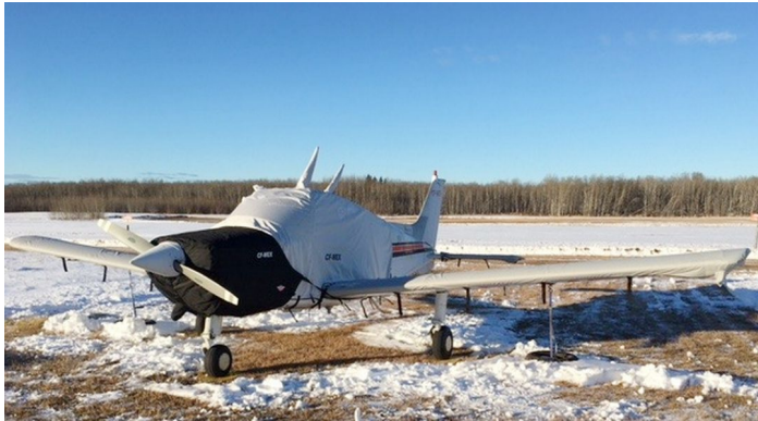
Beech Sport Insulated Engine Cover & Winter Cover Set

This cover type is made from Silver Acrylic Sunbrella canvas and is 100% lined with a soft and smooth microfiber. Bruce's Custom Covers developed this material combination especially for aircraft protection. The outer material is medium weight and treated for water resistance, UV resistance and anti-static buildup. The inner lining is a very soft and smooth microfiber to prevent scratching. The material is very reflective, and tests show that the cabin interior temperature can be reduced to near-ambient temperature on the hottest of days. It is water, ice and snow repellent, yet breathable to allow moisture to escape from between the cover and the aircraft surface.