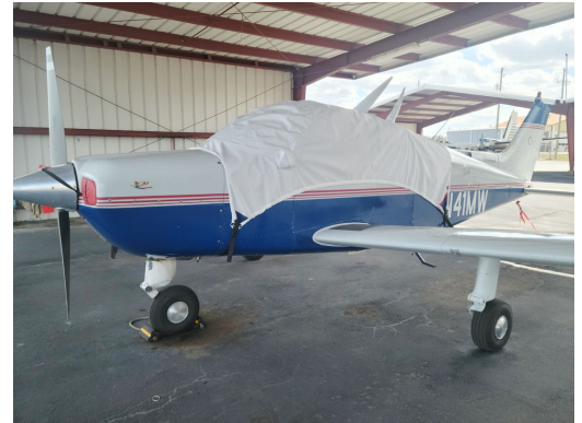
Beech Sundowner C23 Canopy Cover