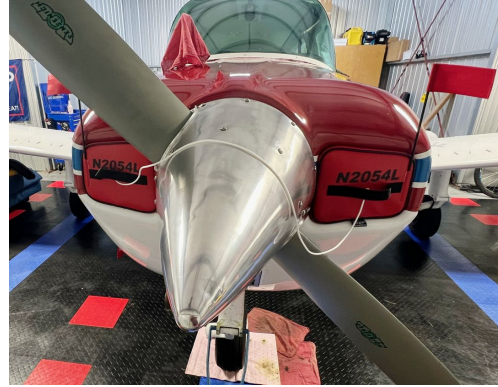
Beech Sundowner Engine Plugs