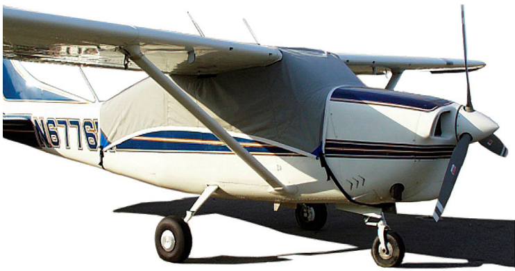
Canopy covers are available in belly strap, snap-on or Over-the-Top Styles