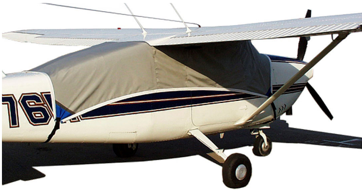
Cessna 206 Standard Canopy Cover