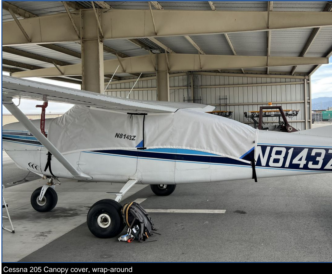
Cessna 205 Canopy cover, wrap-around