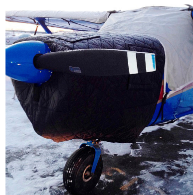
Cessna 205 Insulated Engine Cover