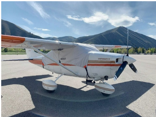
Cessna 206 Canopy Cover, Over-Top Style

This cover type is made from Silver Acrylic Sunbrella canvas and is 100% lined with a soft and smooth microfiber. Bruce's Custom Covers developed this material combination especially for aircraft protection. The outer material is medium weight and treated for water resistance, UV resistance and anti-static buildup. The inner lining is a very soft and smooth microfiber to prevent scratching. The material is very reflective, and tests show that the cabin interior temperature can be reduced to near-ambient temperature on the hottest of days. It is water, ice and snow repellent, yet breathable to allow moisture to escape from between the cover and the aircraft surface.