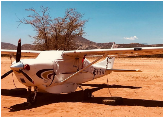
Cessna 206 Canopy Cover