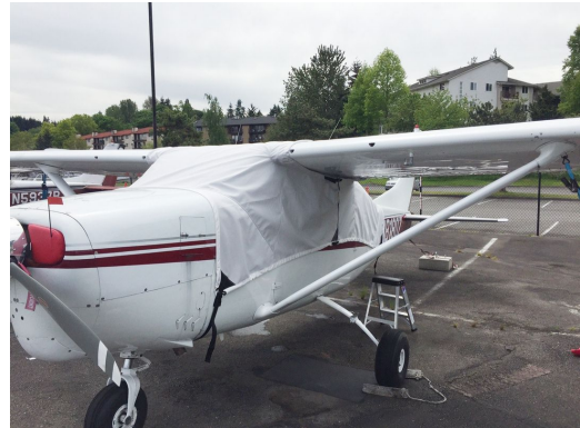
Cessna 205 Over-Top Canopy Cover