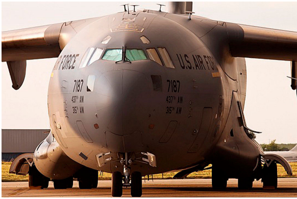
C-17 Cockpit HeatShield Set