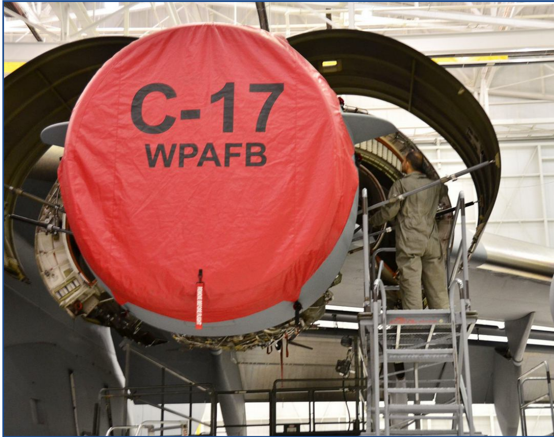
McDonnell Douglas C-17 Intake Cover