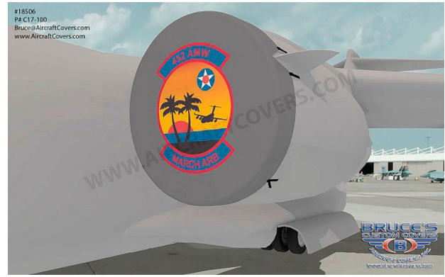
C-17 Engine Intake Cover, 3D mockup