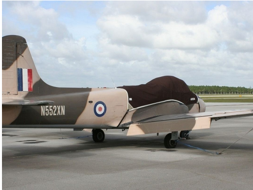
Jet Provost Canopy Cover

Travel Covers are made with Silver Solution-Dyed Polyester fabric and only lined over the windshield to save weight. The material is lightweight and more compact for easy stowage in the aircraft. The polyester material is water resistant, but only intended for occasional use outside. We also have an ultra lightweight material available for fitted hangar dust covers. For daily outdoor use, the non-travel Sunbrella Cover is the best choice.