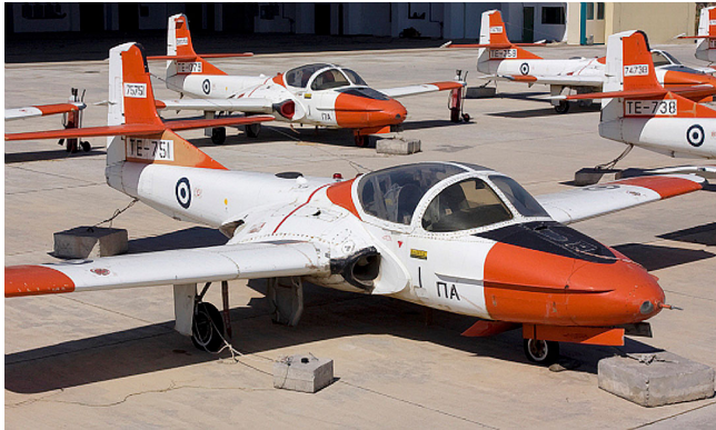
Canopy Cover and Engine Plugs for the Cessna T-37

This cover type is made from Silver Acrylic Sunbrella canvas and is 100% lined with a soft and smooth microfiber. Bruce's Custom Covers developed this material combination especially for aircraft protection. The outer material is medium weight and treated for water resistance, UV resistance and anti-static buildup. The inner lining is a very soft and smooth microfiber to prevent scratching. The material is very reflective, and tests show that the cabin interior temperature can be reduced to near-ambient temperature on the hottest of days. It is water, ice and snow repellent, yet breathable to allow moisture to escape from between the cover and the aircraft surface.