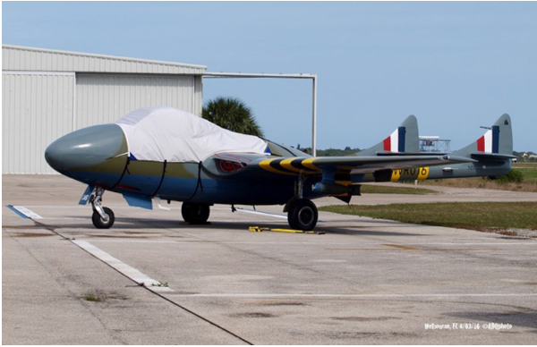
DeHavilland Vampire Canopy Cover

non-travel Sunbrella Cover is the best choice.