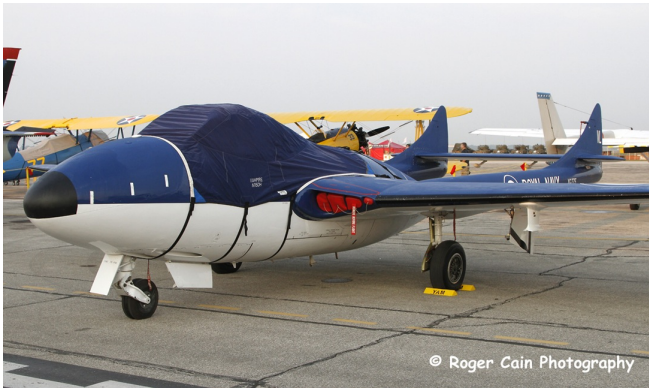
DeHavilland Vampire Canopy Cover, Engine Plugs

Travel Covers are made with Silver Solution-Dyed Polyester fabric and only lined over the windshield to save weight. The material is lightweight and more compact for easy stowage in the aircraft. The polyester material is water resistant, but only intended for occasional use outside. We also have an ultra lightweight material available for fitted hangar dust covers. For daily outdoor use, the non-travel Sunbrella Cover is the best choice.