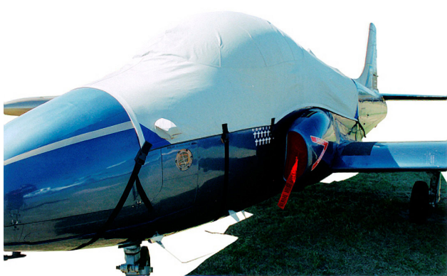
Covers & Plugs for the Jet Provost