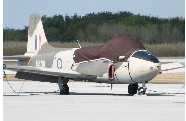
Jet Provost Canopy Cover