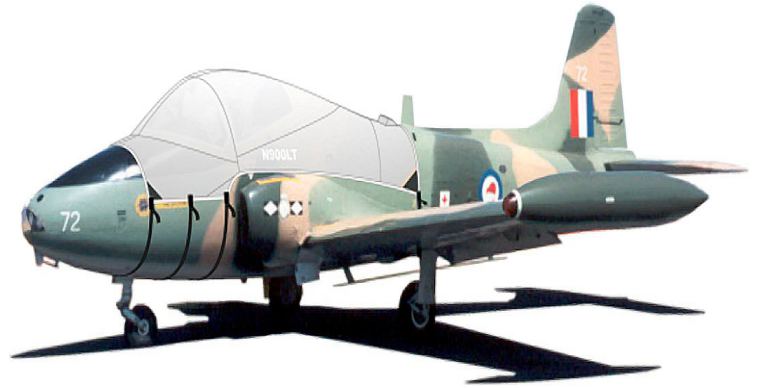
Jet Provost Canopy Cover (Illustration)