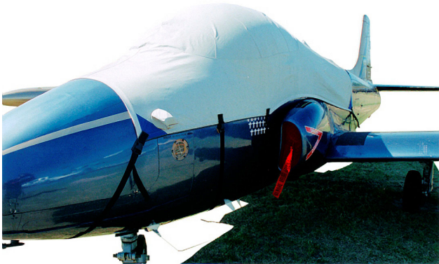
Covers & Plugs for the Jet Provost

This cover type is made from Silver Acrylic Sunbrella canvas and is 100% lined with a soft and smooth microfiber. Bruce's Custom Covers developed this material combination especially for aircraft protection. The outer material is medium weight and treated for water resistance, UV resistance and anti-static buildup. The inner lining is a very soft and smooth microfiber to prevent scratching. The material is very reflective, and tests show that the cabin interior temperature can be reduced to near-ambient temperature on the hottest of days. It is water, ice and snow repellent, yet breathable to allow moisture to escape from between the cover and the aircraft surface.