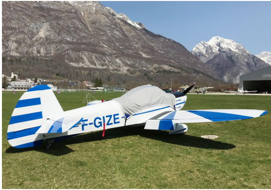
Mudry Cap 10 Canopy Cover

water resistance, UV resistance and anti-static buildup. The inner lining is a very soft and smooth microfiber to prevent scratching. The material is very reflective, and tests show that the cabin interior temperature can be reduced to near-ambient temperature on the hottest of days. It is water, ice and snow repellent, yet breathable to allow moisture to escape from between the cover and the aircraft surface.