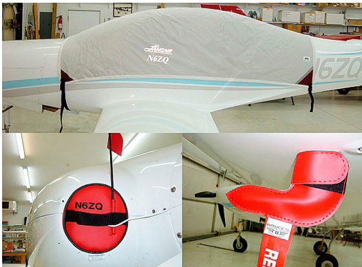
Recommended fly-away kit: Canopy Cover, Engine Inlet Plugs & Pitot Cover