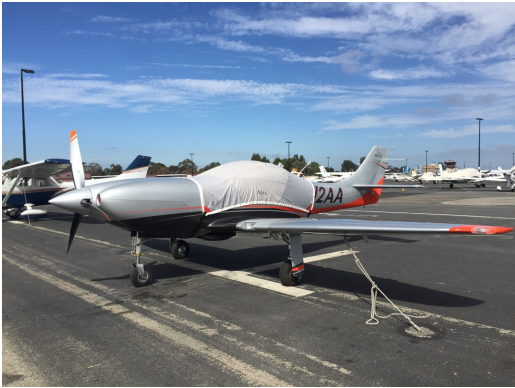
Lancair Legacy 2000 Travel Canopy Cover

Travel Covers are made with Silver Solution-Dyed Polyester fabric and only lined over the windshield to save weight. The material is lightweight and more compact for easy stowage in the aircraft. The polyester material is water resistant, but only intended for occasional use outside. We also have an ultra lightweight material available for fitted hangar dust covers. For daily outdoor use, the non-travel Sunbrella Cover is the best choice.