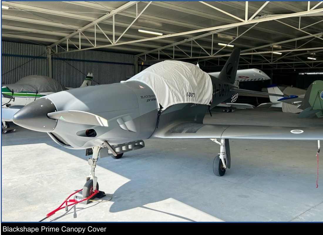
Blackshape Prime Canopy Cover