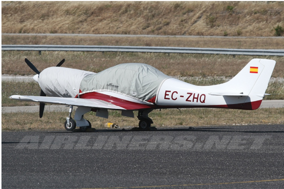
Lancair 360 Canopy Cover, Engine Cover

This cover type is made from Silver Acrylic Sunbrella canvas and is 100% lined with a soft and smooth microfiber. Bruce's Custom Covers developed this material combination especially for aircraft protection. The outer material is medium weight and treated for water resistance, UV resistance and anti-static buildup. The inner lining is a very soft and smooth microfiber to prevent scratching. The material is very reflective, and tests show that the cabin interior temperature can be reduced to near-ambient temperature on the hottest of days. It is water, ice and snow repellent, yet breathable to allow moisture to escape from between the cover and the aircraft surface.