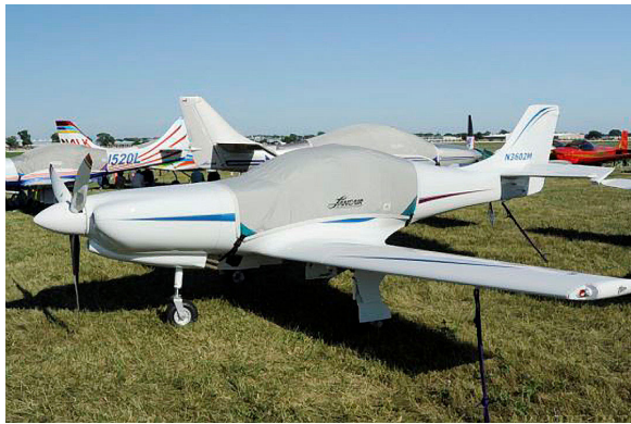
Lancair 360 MkII Canopy Cover

This cover type is made from Silver Acrylic Sunbrella canvas and is 100% lined with a soft and smooth microfiber. Bruce's Custom Covers developed this material combination especially for aircraft protection. The outer material is medium weight and treated for water resistance, UV resistance and anti-static buildup. The inner lining is a very soft and smooth microfiber to prevent scratching. The material is very reflective, and tests show that the cabin interior temperature can be reduced to near-ambient temperature on the hottest of days. It is water, ice and snow repellent, yet breathable to allow moisture to escape from between the cover and the aircraft surface.