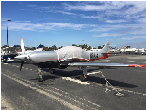
Lancair Legacy 2000 Travel Canopy Cover

Travel Covers are made with Silver Solution-Dyed Polyester fabric and only lined over the windshield to save weight. The material is lightweight and more compact for easy stowage in the aircraft. The polyester material is water resistant, but only intended for occasional use outside. We also have an ultra lightweight material available for fitted hangar dust covers. For daily outdoor use, the non-travel Sunbrella Cover is the best choice.