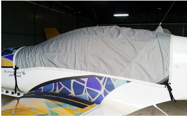
Blackshape Prime Travel Cover, Light Weight Travel Canopy Cover