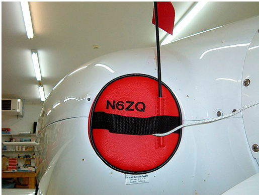
Lancair 320 Engine Inlet Plugs