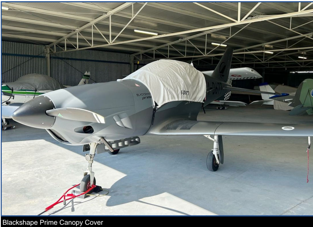
Blackshape Prime Canopy Cover