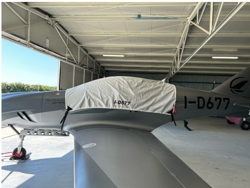
Blackshape Prime Canopy Cover

This cover type is made from Silver Acrylic Sunbrella canvas and is 100% lined with a soft and smooth microfiber. Bruce's Custom Covers developed this material combination especially for aircraft protection. The outer material is medium weight and treated for water resistance, UV resistance and anti-static buildup. The inner lining is a very soft and smooth microfiber to prevent scratching. The material is very reflective, and tests show that the cabin interior temperature can be reduced to near-ambient temperature on the hottest of days. It is water, ice and snow repellent, yet breathable to allow moisture to escape from between the cover and the aircraft surface.