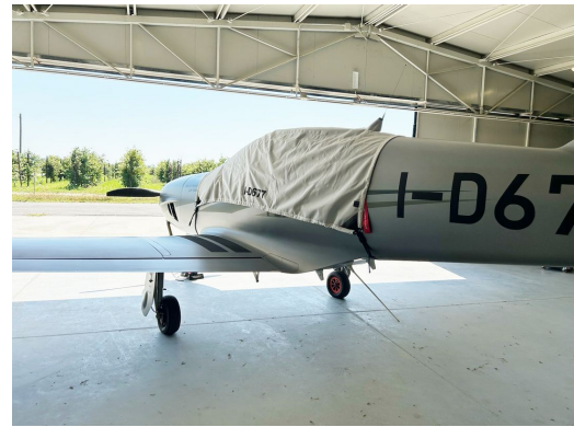
Blackshape Prime Canopy Cover