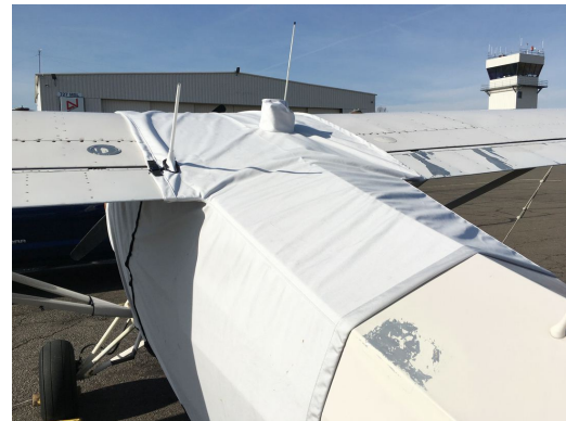
Maule M-5-235C Extended Canopy Cover