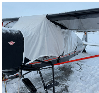
Bushmaster Canopy & Insulated Engine Covers