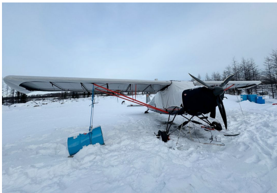
Bushmaster Wing, Canopy & Insulated Engine Covers

This cover type is made from Silver Acrylic Sunbrella canvas and is 100% lined with a soft and smooth microfiber. Bruce's Custom Covers developed this material combination especially for aircraft protection. The outer material is medium weight and treated for water resistance, UV resistance and anti-static buildup. The inner lining is a very soft and smooth microfiber to prevent scratching. The material is very reflective, and tests show that the cabin interior temperature can be reduced to near-ambient temperature on the hottest of days. It is water, ice and snow repellent, yet breathable to allow moisture to escape from between the cover and the aircraft surface.