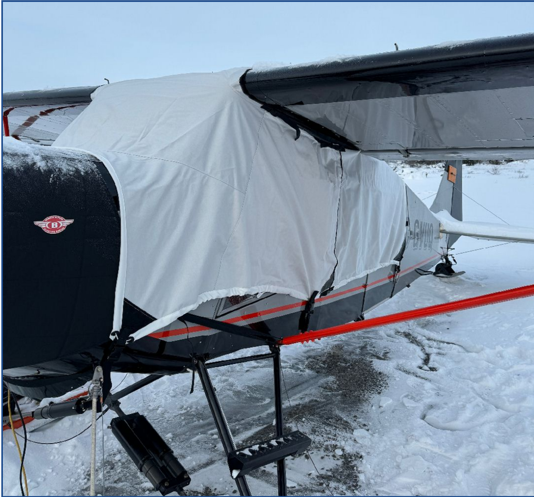
Bushmaster Canopy &amp; Insulated Engine Covers