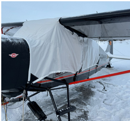
Bushmaster Canopy & Insulated Engine Covers

This cover type is made from Silver Acrylic Sunbrella canvas and is 100% lined with a soft and smooth microfiber. Bruce's Custom Covers developed this material combination especially for aircraft protection. The outer material is medium weight and treated for water resistance, UV resistance and anti-static buildup. The inner lining is a very soft and smooth microfiber to prevent scratching. The material is very reflective, and tests show that the cabin interior temperature can be reduced to near-ambient temperature on the hottest of days. It is water, ice and snow repellent, yet breathable to allow moisture to escape from between the cover and the aircraft surface.