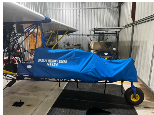
Breezy RLU-1 Forward Fuselage Enclosure