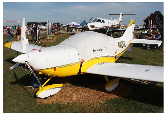
PiperSport Canopy Cover, Engine Plugs