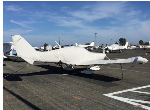
BRM Bristell S-LSA Full Cover Set