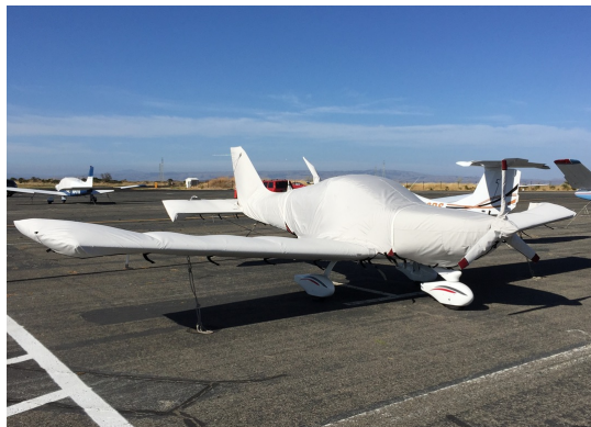
BRM Bristell S-LSA Full Cover Set