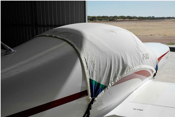
Pulsar Canopy Cover

This cover type is made from Silver Acrylic Sunbrella canvas and is 100% lined with a soft and smooth microfiber. Bruce's Custom Covers developed this material combination especially for aircraft protection. The outer material is medium weight and treated for water resistance, UV resistance and anti-static buildup. The inner lining is a very soft and smooth microfiber to prevent scratching. The material is very reflective, and tests show that the cabin interior temperature can be reduced to near-ambient temperature on the hottest of days. It is water, ice and snow repellent, yet breathable to allow moisture to escape from between the cover and the aircraft surface.