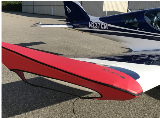
BRM Aero Bristell S-LSA Wingtip Pads

Designed to prevent damage to the aircraft extremities in crowded hangars, these products are made of bright red Naugahyde and thickly padded with a sandwich of closed cell foam.