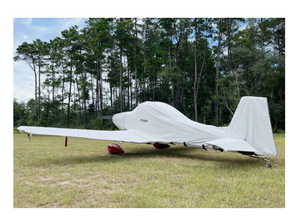
Bushby Mustang Complete Fuselage Cover with Detachable Wing Covers