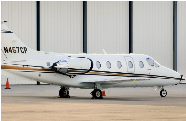
Beechjet 400 Engine Covers, Bikini Type