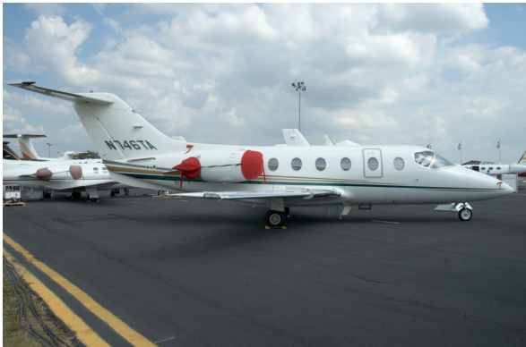
Beechjet 400 Engine Covers

The Hawker Beechcraft Beechjet 400, Hawker 400XP (T1A, T400 Jayhawk) Intake Covers are designed to install easily yet be completely storable. A spring steel hoop is sewn into the hem of each cover, allowing them to be installed without climbing onto the wing or using a stepladder. To store the covers the spring steel hoop folds like a band-saw blade into three nesting rings. Each cover folds into a compact circular bundle which is stored in the included duffle bag, yet they unfold quickly for use. The Tri-Fold Ring cover is made of medium weight nylon which is available in a variety of colors to match the paint trim. Each cover set comes complete with installation and folding instructions. The aircraft's registration number can be silkscreened onto the cover for an extra charge.