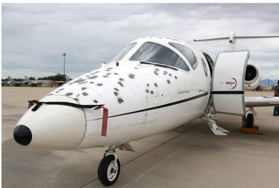
Raytheon Beechjet Hail Damage, and Pitot Covers

This cover type is made from Silver Acrylic Sunbrella canvas and is 100% lined with a soft and smooth microfiber. Bruce's Custom Covers developed this material combination especially for aircraft protection. The outer material is medium weight and treated for water resistance, UV resistance and anti-static buildup. The inner lining is a very soft and smooth microfiber to prevent scratching. The material is very reflective, and tests show that the cabin interior temperature can be reduced to near-ambient temperature on the hottest of days. It is water, ice and snow repellent, yet breathable to allow moisture to escape from between the cover and the aircraft surface.