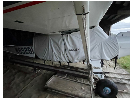
Avipro Bearhawk Extended Over The Top Canopy Cover