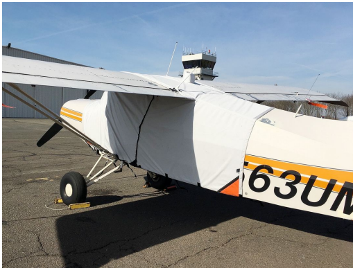
Maule M-5-235C Extended Canopy Cover

This cover type is made from Silver Acrylic Sunbrella canvas and is 100% lined with a soft and smooth microfiber. Bruce's Custom Covers developed this material combination especially for aircraft protection. The outer material is medium weight and treated for water resistance, UV resistance and anti-static buildup. The inner lining is a very soft and smooth microfiber to prevent scratching. The material is very reflective, and tests show that the cabin interior temperature can be reduced to near-ambient temperature on the hottest of days. It is water, ice and snow repellent, yet breathable to allow moisture to escape from between the cover and the aircraft surface.