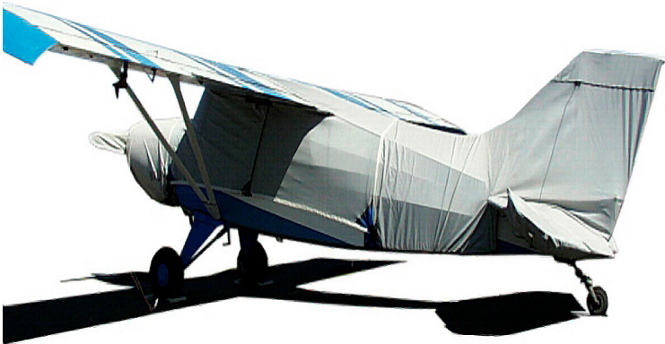
Maule Empennage, Engine & Prop Covers

WINTER USE MATERIAL - Made with Solution-Dyed Polyester fabric, this option is intended for seasonal use to aid in deicing, rain mitigation, or for occasional travel. The material is lighter and more compact, but more susceptible to UV damage and may have a shorter useful life if used continuously outside than the all-year use material.