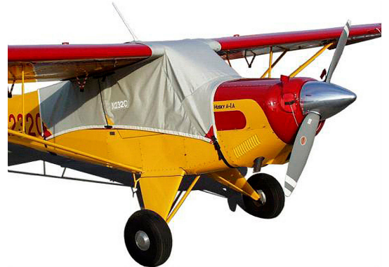
Aviat Husky Canopy Cover & Engine Plugs