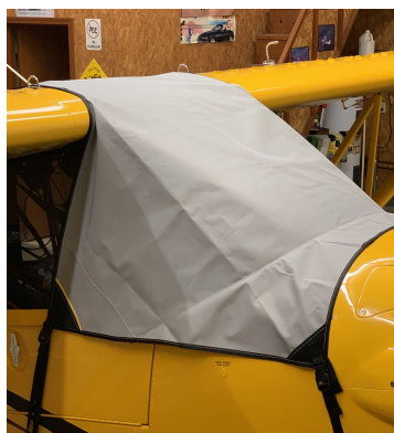
Cub Crafters Carbon Cub FX3 Windshield/Skylight Cover, travel weight

This cover type is made from Silver Acrylic Sunbrella canvas and is 100% lined with a soft and smooth microfiber. Bruce's Custom Covers developed this material combination especially for aircraft protection. The outer material is medium weight and treated for water resistance, UV resistance and anti-static buildup. The inner lining is a very soft and smooth microfiber to prevent scratching. The material is very reflective, and tests show that the cabin interior temperature can be reduced to near-ambient temperature on the hottest of days. It is water, ice and snow repellent, yet breathable to allow moisture to escape from between the cover and the aircraft surface.