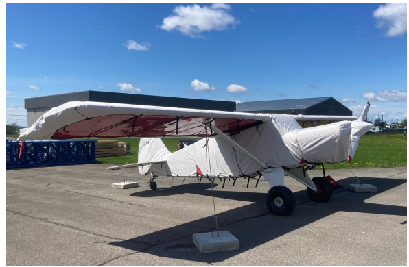
Bearhawk 4-Place Complete Cover Set, AFTER