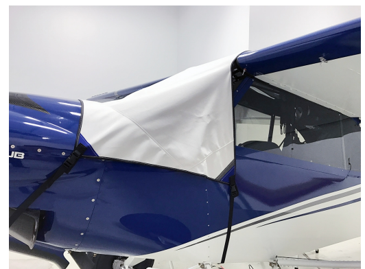
Cub Crafters CC-11 Windshield Cover