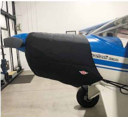
Bearhawk Patrol Insulated Engine Cover

This cover type is made from Silver Acrylic Sunbrella canvas and is 100% lined with a soft and smooth microfiber. Bruce's Custom Covers developed this material combination especially for aircraft protection. The outer material is medium weight and treated for water resistance, UV resistance and anti-static buildup. The inner lining is a very soft and smooth microfiber to prevent scratching. The material is very reflective, and tests show that the cabin interior temperature can be reduced to near-ambient temperature on the hottest of days. It is water, ice and snow repellent, yet breathable to allow moisture to escape from between the cover and the aircraft surface.