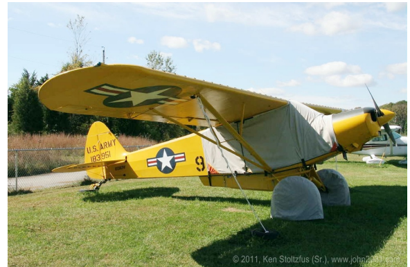
Piper L-21b Extended Canopy Cover, Tire Covers