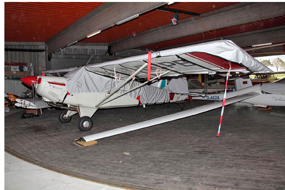
Aviat Husky Engine Plugs, Canopy, Wing & Empennage Covers