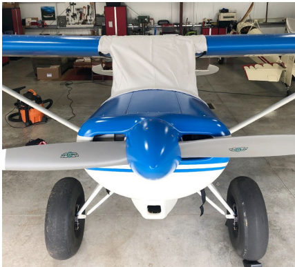
Bearhawk 2-Place Model Canopy Cover

This cover type is made from Silver Acrylic Sunbrella canvas and is 100% lined with a soft and smooth microfiber. Bruce's Custom Covers developed this material combination especially for aircraft protection. The outer material is medium weight and treated for water resistance, UV resistance and anti-static buildup. The inner lining is a very soft and smooth microfiber to prevent scratching. The material is very reflective, and tests show that the cabin interior temperature can be reduced to near-ambient temperature on the hottest of days. It is water, ice and snow repellent, yet breathable to allow moisture to escape from between the cover and the aircraft surface.