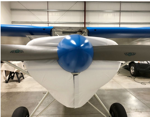
Bearhawk Patrol Engine Cover, test fit cover