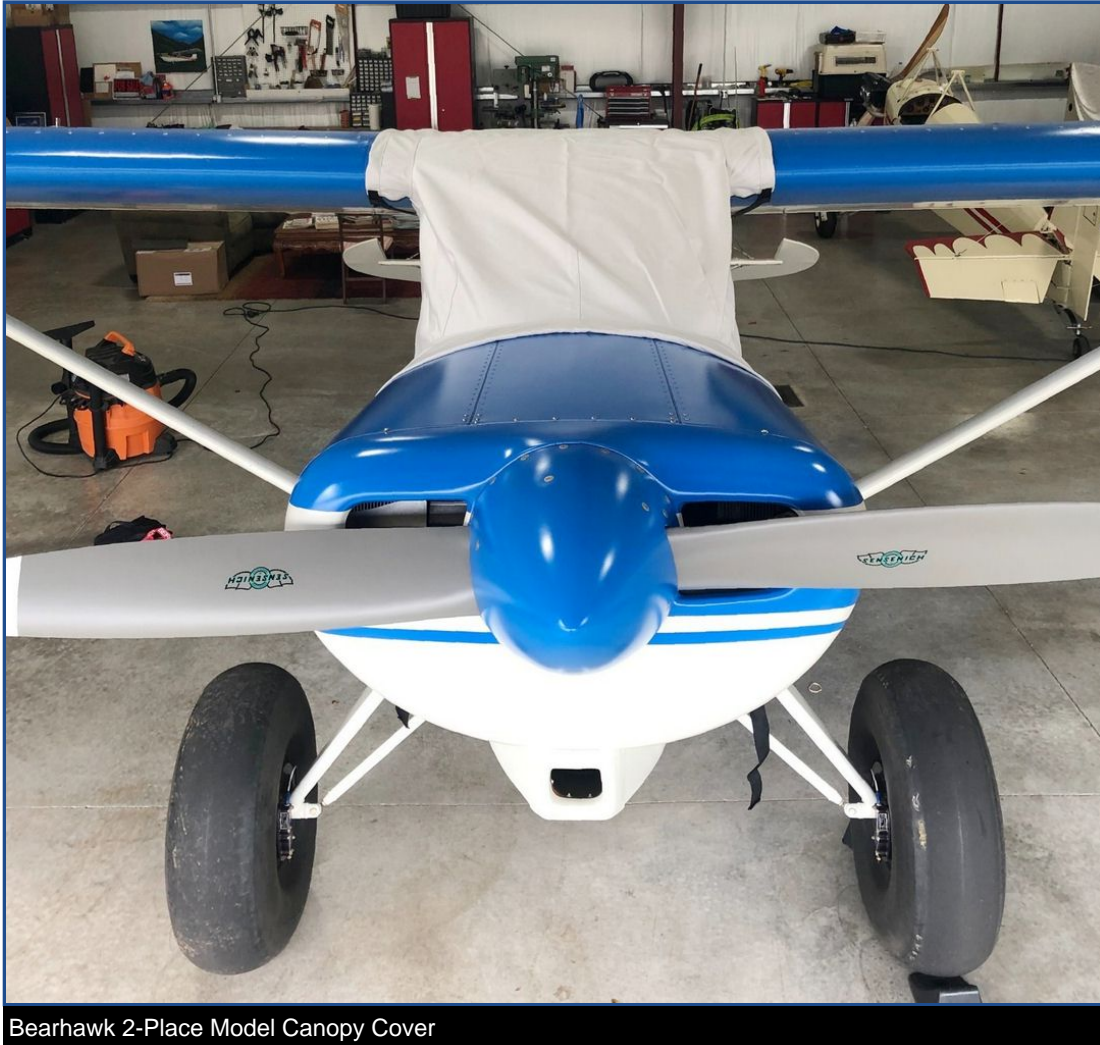
Bearhawk 2-Place Model Canopy Cover