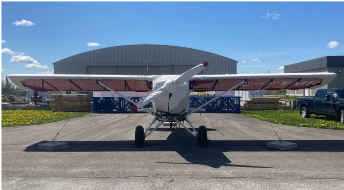
Bearhawk 4-Place Complete Cover Set