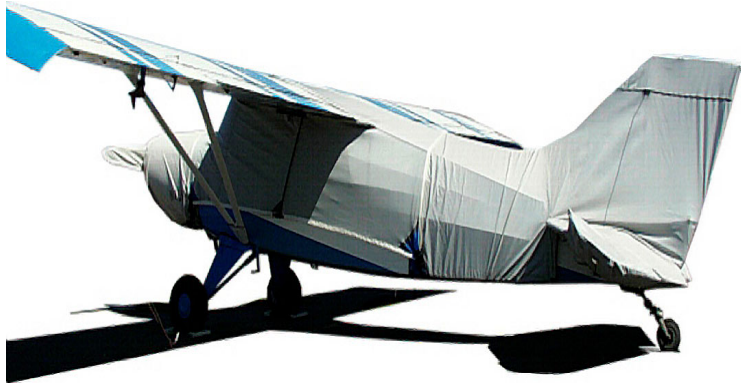
Maule Empennage, Engine & Prop Covers

This cover type is made from Silver Acrylic Sunbrella canvas and is 100% lined with a soft and smooth microfiber. Bruce's Custom Covers developed this material combination especially for aircraft protection. The outer material is medium weight and treated for water resistance, UV resistance and anti-static buildup. The inner lining is a very soft and smooth microfiber to prevent scratching. The material is very reflective, and tests show that the cabin interior temperature can be reduced to near-ambient temperature on the hottest of days. It is water, ice and snow repellent, yet breathable to allow moisture to escape from between the cover and the aircraft surface.