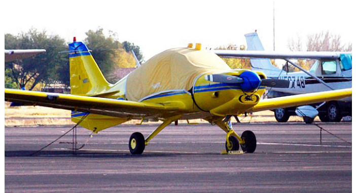
Beagle Pup Canopy Cover