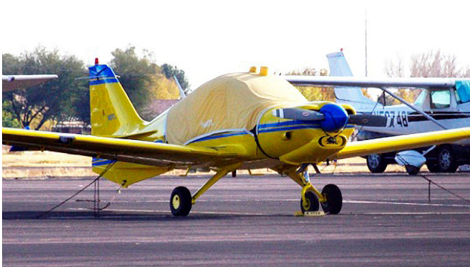
Beagle Pup Canopy Cover