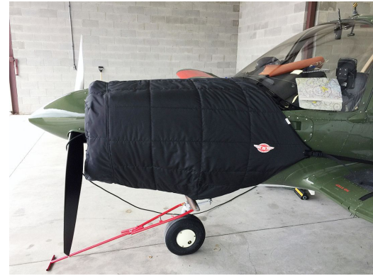
Scottish Aviation Bulldog Insulated Engine Cover