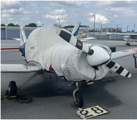
Scottish Aviation Bulldog Canopy & Engine Covers

This cover type is made from Silver Acrylic Sunbrella canvas and is 100% lined with a soft and smooth microfiber. Bruce's Custom Covers developed this material combination especially for aircraft protection. The outer material is medium weight and treated for water resistance, UV resistance and anti-static buildup. The inner lining is a very soft and smooth microfiber to prevent scratching. The material is very reflective, and tests show that the cabin interior temperature can be reduced to near-ambient temperature on the hottest of days. It is water, ice and snow repellent, yet breathable to allow moisture to escape from between the cover and the aircraft surface.