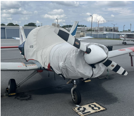
Scottish Aviation Bulldog Canopy & Engine Covers

This cover type is made from Silver Acrylic Sunbrella canvas and is 100% lined with a soft and smooth microfiber. Bruce's Custom Covers developed this material combination especially for aircraft protection. The outer material is medium weight and treated for water resistance, UV resistance and anti-static buildup. The inner lining is a very soft and smooth microfiber to prevent scratching. The material is very reflective, and tests show that the cabin interior temperature can be reduced to near-ambient temperature on the hottest of days. It is water, ice and snow repellent, yet breathable to allow moisture to escape from between the cover and the aircraft surface.