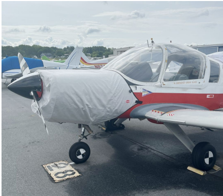
Scottish Aviation Bulldog Engine Cover