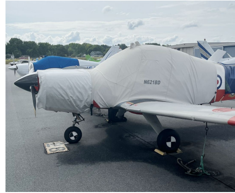
Scottish Aviation Bulldog Canopy & Engine Covers