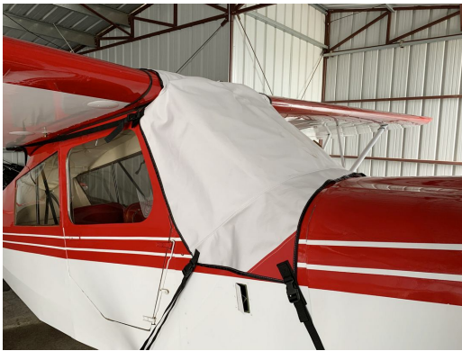
Bellanca Citabria Windshield/Skylight Cover

This cover type is made from Silver Acrylic Sunbrella canvas and is 100% lined with a soft and smooth microfiber. Bruce's Custom Covers developed this material combination especially for aircraft protection. The outer material is medium weight and treated for water resistance, UV resistance and anti-static buildup. The inner lining is a very soft and smooth microfiber to prevent scratching. The material is very reflective, and tests show that the cabin interior temperature can be reduced to near-ambient temperature on the hottest of days. It is water, ice and snow repellent, yet breathable to allow moisture to escape from between the cover and the aircraft surface.