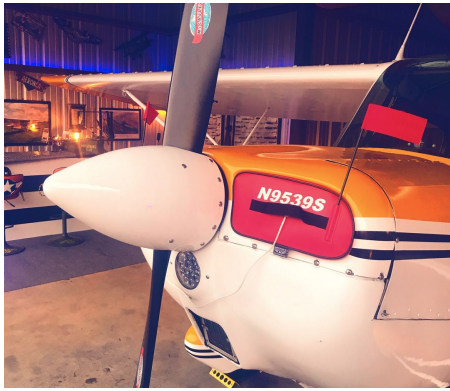
Bellanca Citabria Engine Plugs