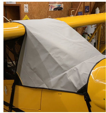
Cub Crafters Carbon Cub FX3 Windshild/Skylight Cover, travel weight