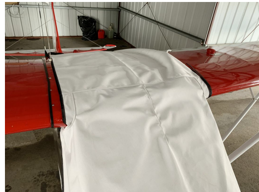
Bellanca Citabria Windshield/Skylight Cover