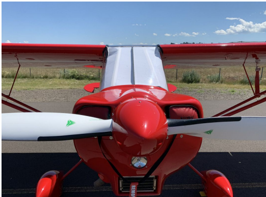
Bellanca Decathlon 8KCAB Heatshield Set with white side out

Windshield Heatshields are interior sunshades for an aircraft's front windshield. The product is a unique composite of closed-cell foam with a silver mylar finish. The semi-rigid design is stiff enough to stand along the inside of the windshield using sun visors or window framing. It folds up flat and easily stores in the included storage sleeve. Some designs may require velcro and suction cups or split right and left sides. A Heatshield is an excellent short-term remedy for cockpit overheating. An external fabric cover is far more effective and practical for long-term protection.