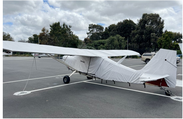
Bellanca Decathlon Full Cover Set