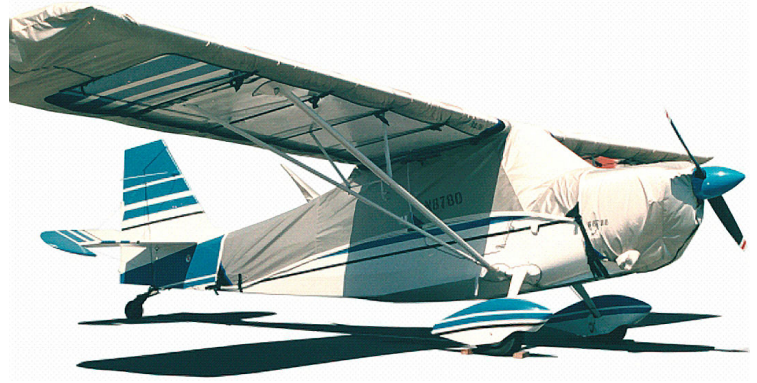
Bellanca Decathlon Canopy Cover (Over-Top, Extended to tail), Wing Covers.