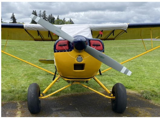
American Champion Citabria canopy cover over the top style, extends to cover gas caps, Engine Plugs