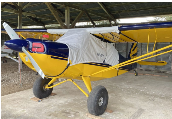
American Champion Citabria canopy cover over the top style, extends to cover gas caps, Engine Plugs