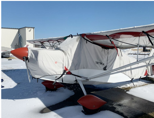
American Champion Decathlon Extended Canopy, Engine, Wing & Empennage Covers

This cover type is made from Silver Acrylic Sunbrella canvas and is 100% lined with a soft and smooth microfiber. Bruce's Custom Covers developed this material combination especially for aircraft protection. The outer material is medium weight and treated for water resistance, UV resistance and anti-static buildup. The inner lining is a very soft and smooth microfiber to prevent scratching. The material is very reflective, and tests show that the cabin interior temperature can be reduced to near-ambient temperature on the hottest of days. It is water, ice and snow repellent, yet breathable to allow moisture to escape from between the cover and the aircraft surface.