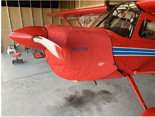
American Champion 8KCAB Insulated Engine Cover

This cover type is made from Silver Acrylic Sunbrella canvas and is 100% lined with a soft and smooth microfiber. Bruce's Custom Covers developed this material combination especially for aircraft protection. The outer material is medium weight and treated for water resistance, UV resistance and anti-static buildup. The inner lining is a very soft and smooth microfiber to prevent scratching. The material is very reflective, and tests show that the cabin interior temperature can be reduced to near-ambient temperature on the hottest of days. It is water, ice and snow repellent, yet breathable to allow moisture to escape from between the cover and the aircraft surface.