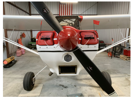
BELLANCA 7ECA Engine Inlet Plugs