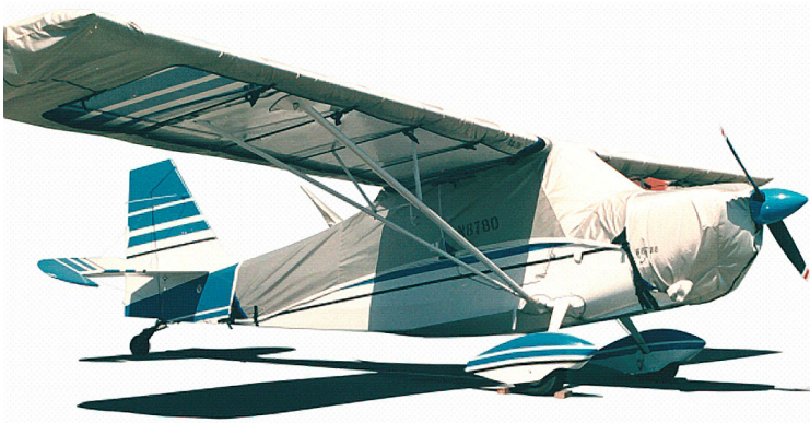
Bellanca Citabria Extended Canopy Cover (extended to tail), Bellanca Citabria Over-Top Canopy Cover, Extended to Tail, Engine Empennage, Wing, Insulated Engine Cover & Wing Covers