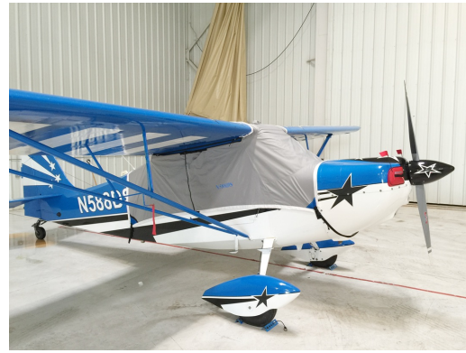
Bellanca Citabria Light Weight Travel Cover, Engine Plugs