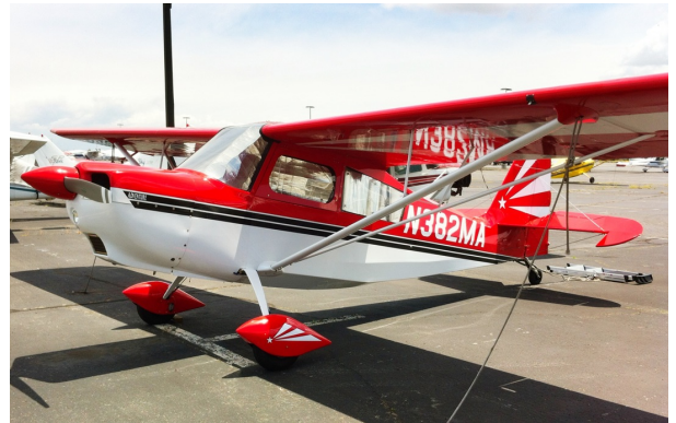
Bellanca Decathlon HeatShield Set