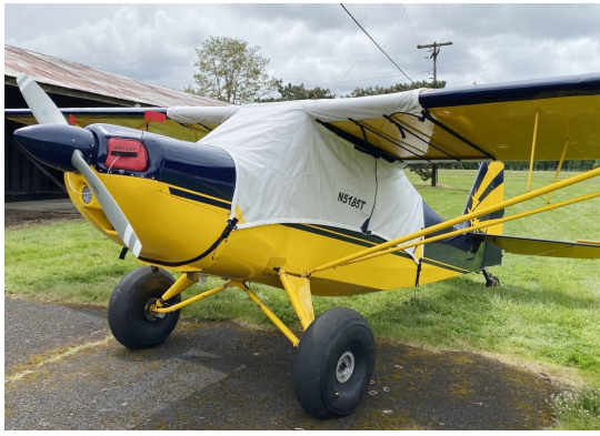
American Champion Citabria canopy cover over the top style, extends to cover gas caps, Engine Plugs