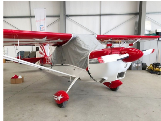
Bellanca Decathlon Travel Weight Over-Top Canopy Cover