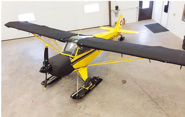
Aviat Husky Insulated Engine Cover, Wing Covers