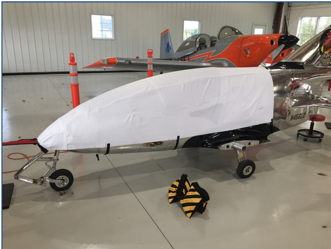
Bede BD-5 Canopy/Nose Cover, test fit cover