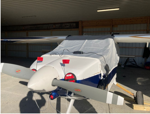
Bede BD-4 Travel Cover, Light Weight Canopy Cover, Wrap-Around

water resistance, UV resistance and anti-static buildup. The inner lining is a very soft and smooth microfiber to prevent scratching. The material is very reflective, and tests show that the cabin interior temperature can be reduced to near-ambient temperature on the hottest of days. It is water, ice and snow repellent, yet breathable to allow moisture to escape from between the cover and the aircraft surface.