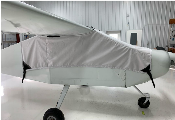
Bede BD-4 Canopy Cover

water resistance, UV resistance and anti-static buildup. The inner lining is a very soft and smooth microfiber to prevent scratching. The material is very reflective, and tests show that the cabin interior temperature can be reduced to near-ambient temperature on the hottest of days. It is water, ice and snow repellent, yet breathable to allow moisture to escape from between the cover and the aircraft surface.