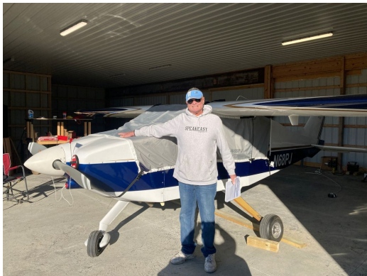
Bede BD-4 Travel Cover, Light Weight Canopy Cover, Wrap-Around

This cover type is made from Silver Acrylic Sunbrella canvas and is 100% lined with a soft and smooth microfiber. Bruce's Custom Covers developed this material combination especially for aircraft protection. The outer material is medium weight and treated for water resistance, UV resistance and anti-static buildup. The inner lining is a very soft and smooth microfiber to prevent scratching. The material is very reflective, and tests show that the cabin interior temperature can be reduced to near-ambient temperature on the hottest of days. It is water, ice and snow repellent, yet breathable to allow moisture to escape from between the cover and the aircraft surface.