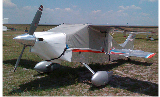
Covers & Plugs for the Bede BD-4