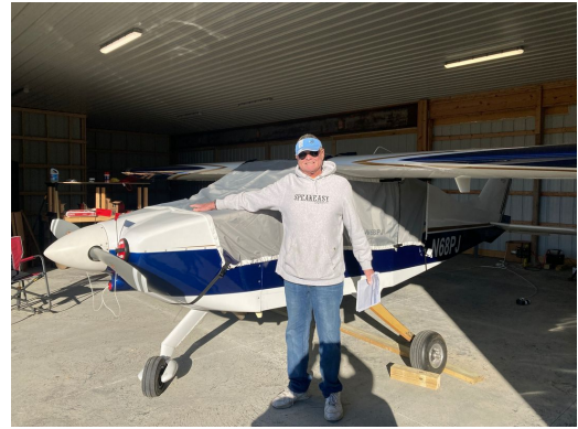
Bede BD-4 Travel Cover, Light Weight Canopy Cover, Wrap-Around