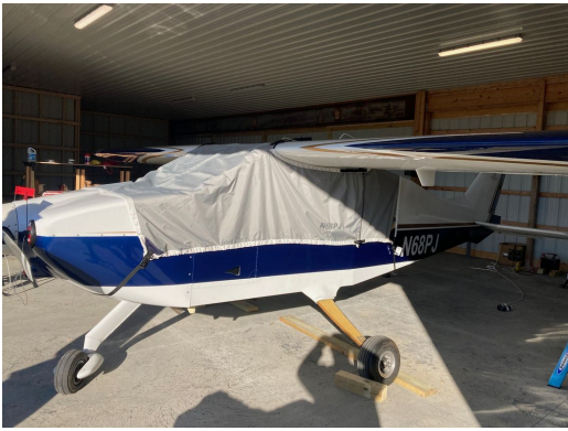
Bede BD-4 Travel Cover, Light Weight Canopy Cover, Wrap-Around