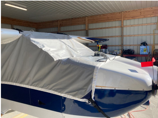
Bede BD-4 Travel Cover, Light Weight Canopy Cover, Wrap-Around