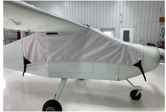
Bede BD-4 Canopy Cover