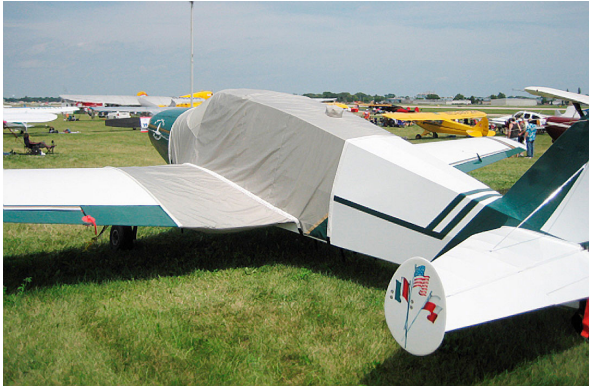
Extended Canopy Cover with Wing Extensions

This cover type is made from Silver Acrylic Sunbrella canvas and is 100% lined with a soft and smooth microfiber. Bruce's Custom Covers developed this material combination especially for aircraft protection. The outer material is medium weight and treated for water resistance, UV resistance and anti-static buildup. The inner lining is a very soft and smooth microfiber to prevent scratching. The material is very reflective, and tests show that the cabin interior temperature can be reduced to near-ambient temperature on the hottest of days. It is water, ice and snow repellent, yet breathable to allow moisture to escape from between the cover and the aircraft surface.