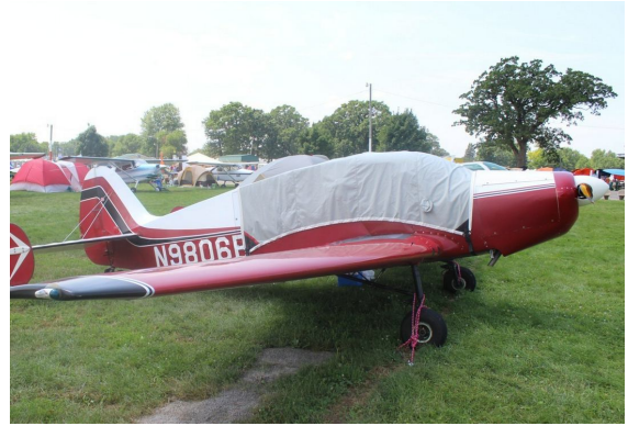
Bellanca Cruisemaster Canopy Cover