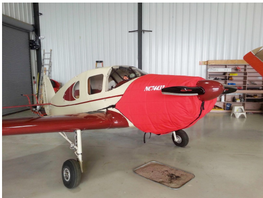
Bellanca Cruisemaster Insulated Engine Cover

This cover type is made from Silver Acrylic Sunbrella canvas and is 100% lined with a soft and smooth microfiber. Bruce's Custom Covers developed this material combination especially for aircraft protection. The outer material is medium weight and treated for water resistance, UV resistance and anti-static buildup. The inner lining is a very soft and smooth microfiber to prevent scratching. The material is very reflective, and tests show that the cabin interior temperature can be reduced to near-ambient temperature on the hottest of days. It is water, ice and snow repellent, yet breathable to allow moisture to escape from between the cover and the aircraft surface.