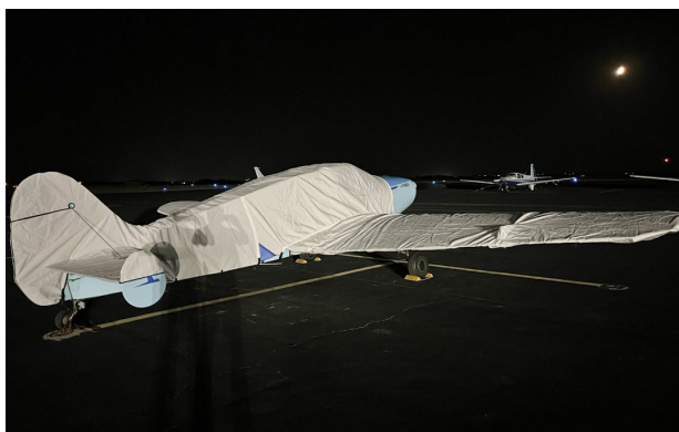
Bellanca Cruisemaster Cover Set