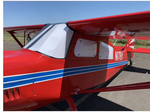
Bellanca Decathlon 8KCAB Heatshield Set with white side out