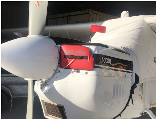
American Champion 8GCBC Scout Engine Inlet Plugs

Engine Inlet Plugs are custom fit for your Bellanca (American Champion) Citabria, Scout, Explorer intakes, made with heavy-duty vinyl material, and stuffed with a single block of sculpted urethane foam. Each plug has a zipper that allows the foam to be removed and dried if necessary. Engine plugs have warning flags that are visible from the cockpit or 'remove before flight' streamers sewn onto the face of the plugs. Most plugs are imprinted with the aircraft registration number in black for an extra charge. Storage bag NOT included. Engine plugs may be inserted after flight when the engine is still warm. Engine Inlet Plugs are commonly referred to as Cowl Plugs, Intake Plugs, Cowl Blocks, Engine Blocks, and Engine Bungs.