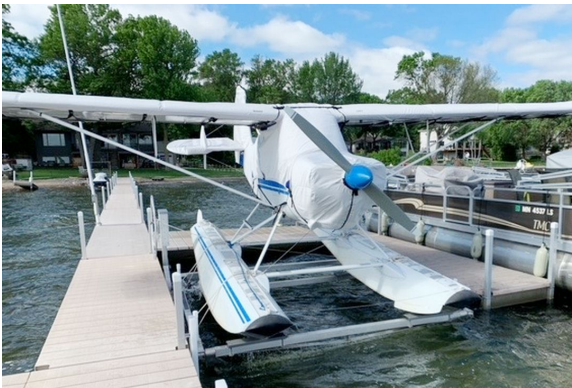
Aeronca 7GC Amphib Cover Set, AFTER

This cover type is made from Silver Acrylic Sunbrella canvas and is 100% lined with a soft and smooth microfiber. Bruce's Custom Covers developed this material combination especially for aircraft protection. The outer material is medium weight and treated for water resistance, UV resistance and anti-static buildup. The inner lining is a very soft and smooth microfiber to prevent scratching. The material is very reflective, and tests show that the cabin interior temperature can be reduced to near-ambient temperature on the hottest of days. It is water, ice and snow repellent, yet breathable to allow moisture to escape from between the cover and the aircraft surface.