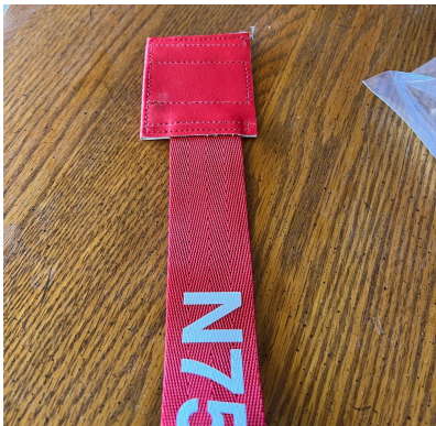
Card Style Pitot Cover for tubes with no metal cover