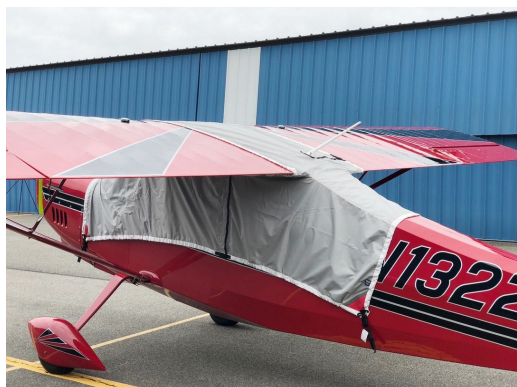
Bellanca Decathlon Travel Canopy Cover

This cover type is made from Silver Acrylic Sunbrella canvas and is 100% lined with a soft and smooth microfiber. Bruce's Custom Covers developed this material combination especially for aircraft protection. The outer material is medium weight and treated for water resistance, UV resistance and anti-static buildup. The inner lining is a very soft and smooth microfiber to prevent scratching. The material is very reflective, and tests show that the cabin interior temperature can be reduced to near-ambient temperature on the hottest of days. It is water, ice and snow repellent, yet breathable to allow moisture to escape from between the cover and the aircraft surface.