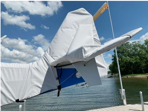
Aeronca 7GC Amphib Cover Set