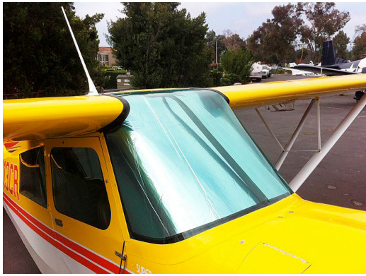
Bellanca Citabria Windshield HeatShield