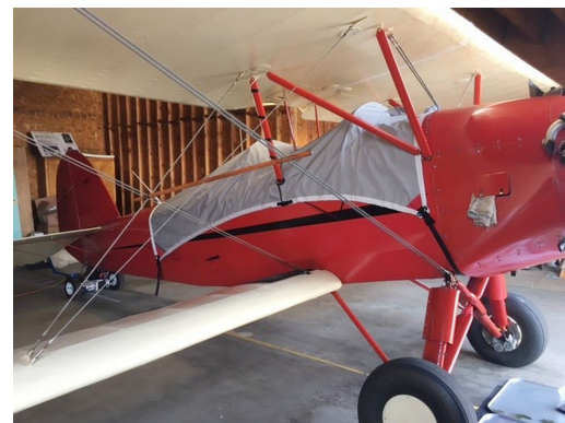
Bird BK Travel Canopy Cover