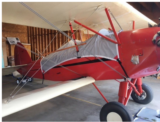
Bird BK Travel Canopy Cover