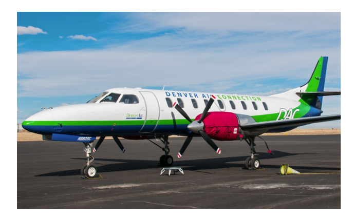
Merlin Insulated Engine Covers