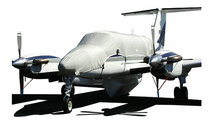
King Air Canopy/Nose Cover

This cover type is made from Silver Acrylic Sunbrella canvas and is 100% lined with a soft and smooth microfiber. Bruce's Custom Covers developed this material combination especially for aircraft protection. The outer material is medium weight and treated for water resistance, UV resistance and anti-static buildup. The inner lining is a very soft and smooth microfiber to prevent scratching. The material is very reflective, and tests show that the cabin interior temperature can be reduced to near-ambient temperature on the hottest of days. It is water, ice and snow repellent, yet breathable to allow moisture to escape from between the cover and the aircraft surface.