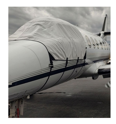
British Aerospace Jetstream 31 Cockpit Cover