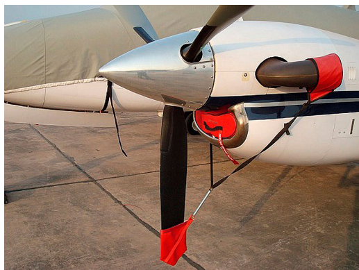
Prop Tie-down/Exhaust Covers

This cover type is made from Silver Acrylic Sunbrella canvas and is 100% lined with a soft and smooth microfiber. Bruce's Custom Covers developed this material combination especially for aircraft protection. The outer material is medium weight and treated for water resistance, UV resistance and anti-static buildup. The inner lining is a very soft and smooth microfiber to prevent scratching. The material is very reflective, and tests show that the cabin interior temperature can be reduced to near-ambient temperature on the hottest of days. It is water, ice and snow repellent, yet breathable to allow moisture to escape from between the cover and the aircraft surface.