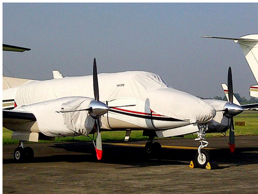
King Air 350 Canopy/Nose Cover, Engine Covers

This cover type is made from Silver Acrylic Sunbrella canvas and is 100% lined with a soft and smooth microfiber. Bruce's Custom Covers developed this material combination especially for aircraft protection. The outer material is medium weight and treated for water resistance, UV resistance and anti-static buildup. The inner lining is a very soft and smooth microfiber to prevent scratching. The material is very reflective, and tests show that the cabin interior temperature can be reduced to near-ambient temperature on the hottest of days. It is water, ice and snow repellent, yet breathable to allow moisture to escape from between the cover and the aircraft surface.