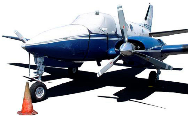
King Air Cockpit Cover, belly-strap type

This cover type is made from Silver Acrylic Sunbrella canvas and is 100% lined with a soft and smooth microfiber. Bruce's Custom Covers developed this material combination especially for aircraft protection. The outer material is medium weight and treated for water resistance, UV resistance and anti-static buildup. The inner lining is a very soft and smooth microfiber to prevent scratching. The material is very reflective, and tests show that the cabin interior temperature can be reduced to near-ambient temperature on the hottest of days. It is water, ice and snow repellent, yet breathable to allow moisture to escape from between the cover and the aircraft surface.