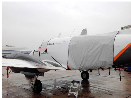
King Air Cargo/Jump Door Rain Cover