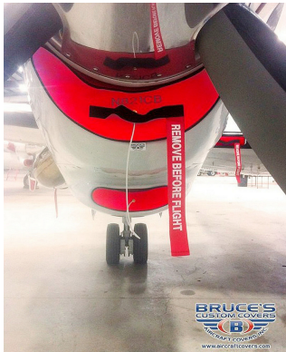
Engine and Oil Cooler Inlet Plugs

Engine Inlet Plugs are custom fit for your Beech 99 Airliner intakes, made with heavy-duty vinyl material, and stuffed with a single block of sculpted urethane foam. Each plug has a zipper that allows the foam to be removed and dried if necessary. Engine plugs have warning flags that are visible from the cockpit or 'remove before flight' streamers sewn onto the face of the plugs. Most plugs are imprinted with the aircraft registration number in black for an extra charge. Storage bag NOT included. Engine plugs may be inserted after flight when the engine is still warm. Engine Inlet Plugs are commonly referred to as Cowl Plugs, Intake Plugs, Cowl Blocks, Engine Blocks, and Engine Bungs.