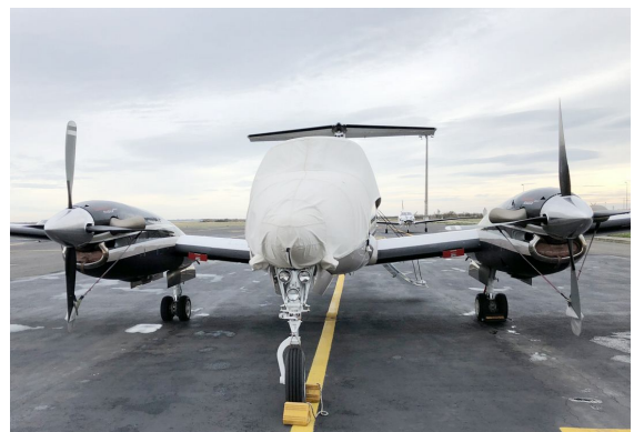
King Air 200 Canopy/Nose Cover