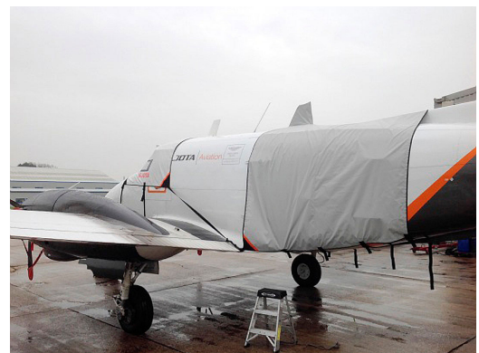
King Air Cargo/Jump Door Rain Cover