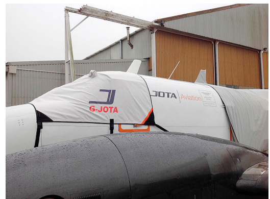
King Air Windshield/Cockpit Cover