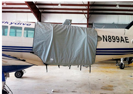
750XL Jump Door Cover