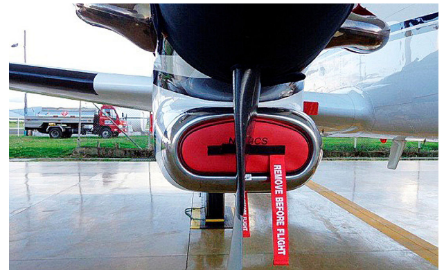
Beech King Air C90B Main Engine Inlet Plug