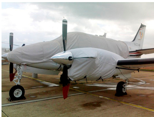
King Air C90 Canopy/Nose Cover, Engine Covers

This cover type is made from Silver Acrylic Sunbrella canvas and is 100% lined with a soft and smooth microfiber. Bruce's Custom Covers developed this material combination especially for aircraft protection. The outer material is medium weight and treated for water resistance, UV resistance and anti-static buildup. The inner lining is a very soft and smooth microfiber to prevent scratching. The material is very reflective, and tests show that the cabin interior temperature can be reduced to near-ambient temperature on the hottest of days. It is water, ice and snow repellent, yet breathable to allow moisture to escape from between the cover and the aircraft surface.