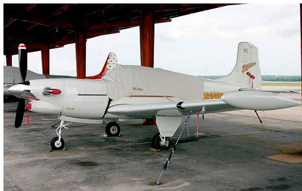
Beech B95 Travel Air Canopy Cover (Turbine Model)