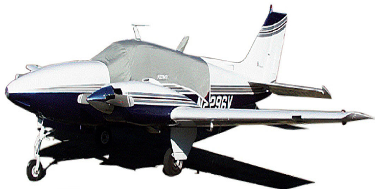
Beech Baron Canopy Cover

Canopy Covers are commonly referred to as Cabin Covers, Fuselage Covers, Canvas Covers, Canopy Caps, etc.