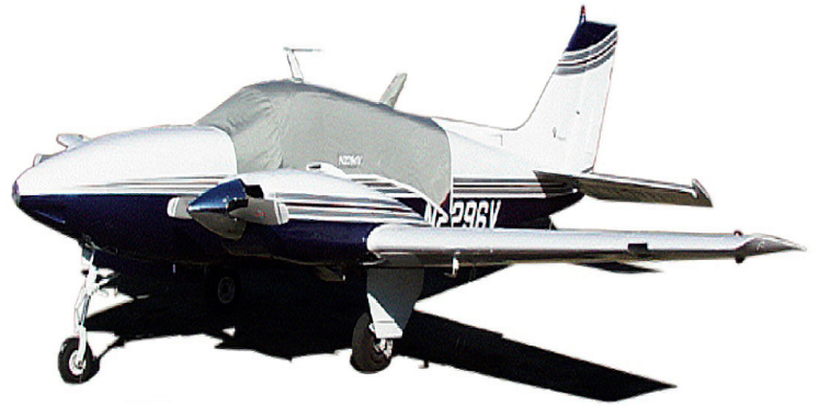
Beech Baron Canopy Cover