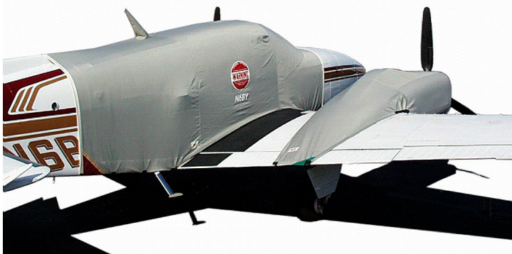
Baron Extended Canopy Cover & Engine Covers

This cover type is made from Silver Acrylic Sunbrella canvas and is 100% lined with a soft and smooth microfiber. Bruce's Custom Covers developed this material combination especially for aircraft protection. The outer material is medium weight and treated for water resistance, UV resistance and anti-static buildup. The inner lining is a very soft and smooth microfiber to prevent scratching. The material is very reflective, and tests show that the cabin interior temperature can be reduced to near-ambient temperature on the hottest of days. It is water, ice and snow repellent, yet breathable to allow moisture to escape from between the cover and the aircraft surface.