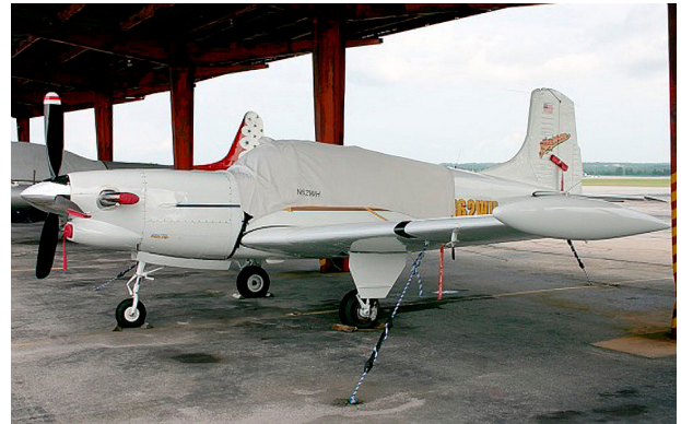
Beech B95 Travel Air Canopy Cover (Turbine Model)