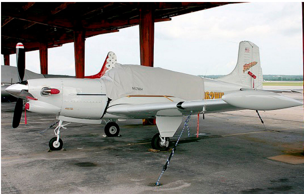
Beech B95 Travel Air Canopy Cover (Turbine Model)

This cover type is made from Silver Acrylic Sunbrella canvas and is 100% lined with a soft and smooth microfiber. Bruce's Custom Covers developed this material combination especially for aircraft protection. The outer material is medium weight and treated for water resistance, UV resistance and anti-static buildup. The inner lining is a very soft and smooth microfiber to prevent scratching. The material is very reflective, and tests show that the cabin interior temperature can be reduced to near-ambient temperature on the hottest of days. It is water, ice and snow repellent, yet breathable to allow moisture to escape from between the cover and the aircraft surface.