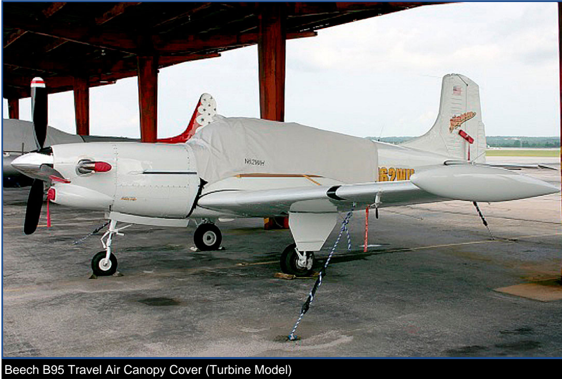
Beech B95 Travel Air Canopy Cover (Turbine Model)