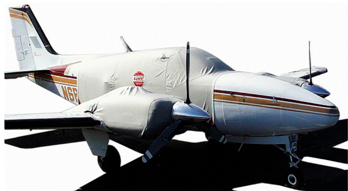
Standard Canopy Cover & Engine Plugs. Extended Canopy Cover & Engine Cover