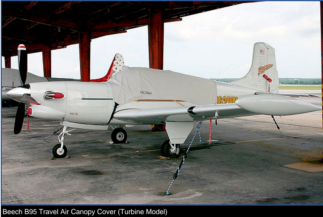
Beech B95 Travel Air Canopy Cover (Turbine Model)