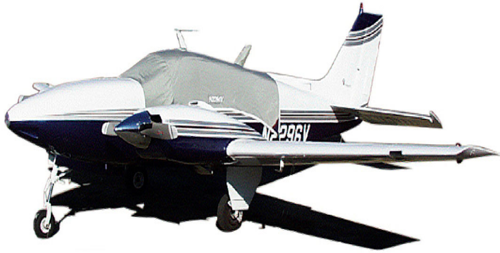
Beech Baron Canopy Cover

Canopy Covers are commonly referred to as Cabin Covers, Fuselage Covers, Canvas Covers, Canopy Caps, etc.