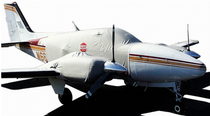
Standard Canopy Cover & Engine Plugs. Extended Canopy Cover & Engine Cover

This cover type is made from Silver Acrylic Sunbrella canvas and is 100% lined with a soft and smooth microfiber. Bruce's Custom Covers developed this material combination especially for aircraft protection. The outer material is medium weight and treated for water resistance, UV resistance and anti-static buildup. The inner lining is a very soft and smooth microfiber to prevent scratching. The material is very reflective, and tests show that the cabin interior temperature can be reduced to near-ambient temperature on the hottest of days. It is water, ice and snow repellent, yet breathable to allow moisture to escape from between the cover and the aircraft surface.