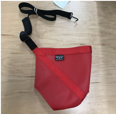
Prop Tie-Down, Various Models (secures with a hook to engine nacelle)

This cover type is made from Silver Acrylic Sunbrella canvas and is 100% lined with a soft and smooth microfiber. Bruce's Custom Covers developed this material combination especially for aircraft protection. The outer material is medium weight and treated for water resistance, UV resistance and anti-static buildup. The inner lining is a very soft and smooth microfiber to prevent scratching. The material is very reflective, and tests show that the cabin interior temperature can be reduced to near-ambient temperature on the hottest of days. It is water, ice and snow repellent, yet breathable to allow moisture to escape from between the cover and the aircraft surface.