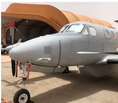
Beech King Air Cockpit HeatShields

Cockpit Heatshields are interior sunshades for the aircraft's cockpit. The product is a unique composite of closed-cell foam with a silver mylar finish. The semi-rigid design is stiff enough to stand inside the window framing. The set folds up flat and is easily stored in the included storage sleeve. Some designs may require velcro and suction cups. A Heatshield is an excellent short-term remedy for cockpit overheating, but an external fabric cover is more effective for long-term protection.