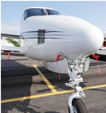
Beech King Air C90 Pitot Covers, Heat Exchanger Plugs