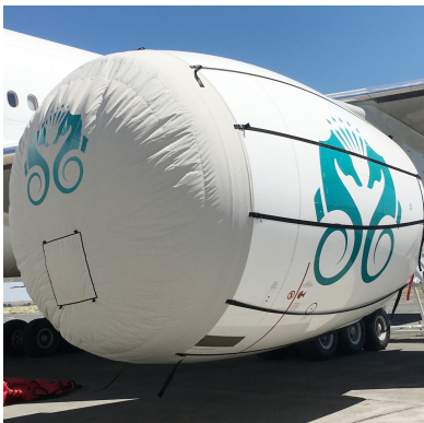
Boeing 777 Intake Covers, GE Engine