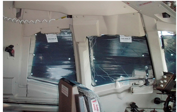
Boeing 767 Cockpit HeatShield set