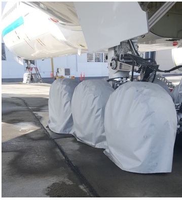
Boeing 777 Main & Nose Gear Tire Covers