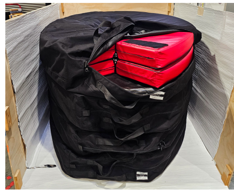
Boeing 777 Intake Plugs, Framed, Bi-Fold Design