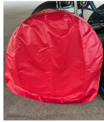
Boeing 777 Main Gear Tire Covers