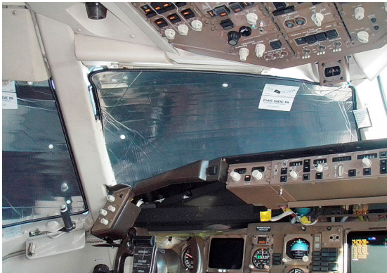
Boeing 767 Cockpit HeatShield set

Cockpit Heatshields are interior sunshades for the aircraft's cockpit. The product is a unique composite of closed-cell foam with a silver mylar finish. The semi-rigid design is stiff enough to stand inside the window framing. The set folds up flat and is easily stored in the included storage sleeve. Some designs may require velcro and suction cups. Our Heatshields for jets are offered white side out because some aircraft manufacturers have issued advisories against reflective window inserts due to potential heat damage. A Heatshield is an excellent short-term remedy for cockpit overheating, but an external fabric cover is more effective for long-term protection.