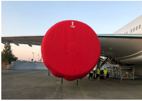
Boeing 777 Intake Covers, GE9X Engine