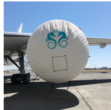
Boeing 777 Intake Covers, GE Engine