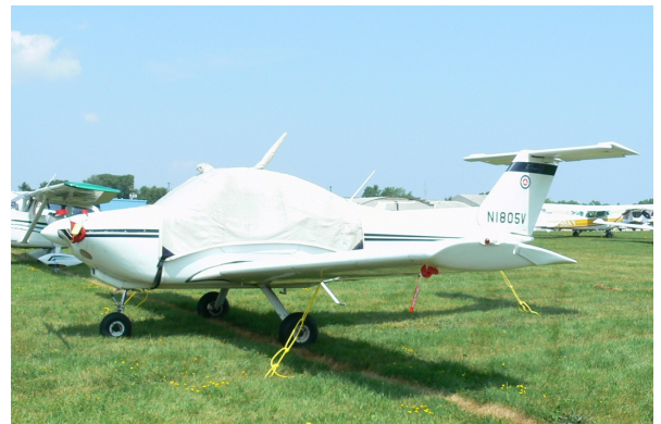
Beech Skipper Canopy Cover, Engine Plugs