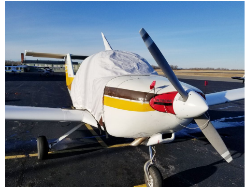
Beech Skipper Extended Canopy Cover and Inlet Plugs