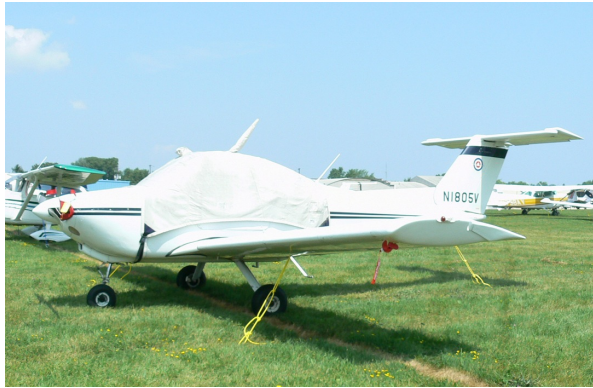
Beech Skipper Canopy Cover, Engine Plugs

plugs are imprinted with the aircraft registration number in black for an extra charge. Storage bag NOT included. Engine plugs may be inserted after flight when the engine is still warm. Engine Inlet Plugs are commonly referred to as Cowl Plugs, Intake Plugs, Cowl Blocks, Engine Blocks, and Engine Bungs.