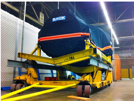
PW JT9D Series Off-Link Engine Transport Cover, Fully Enclosed, P/N: PW-120

FABRIC & THREAD: For strength, durability and ease of use we make these covers of the heaviest nylon ballistic cloth. It is sewn in multiple courses with Tenara thread, and reinforced with heavy vinyl cloth at high-wear points.