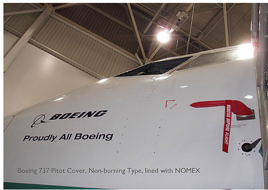
Boeing 737 Heat Resistant Pitot Cover