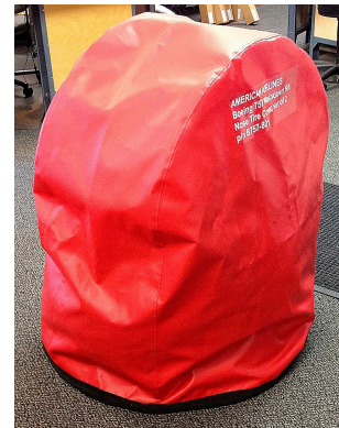
Boeing 757 Tire Covers, Wash Down or Long-term Storage