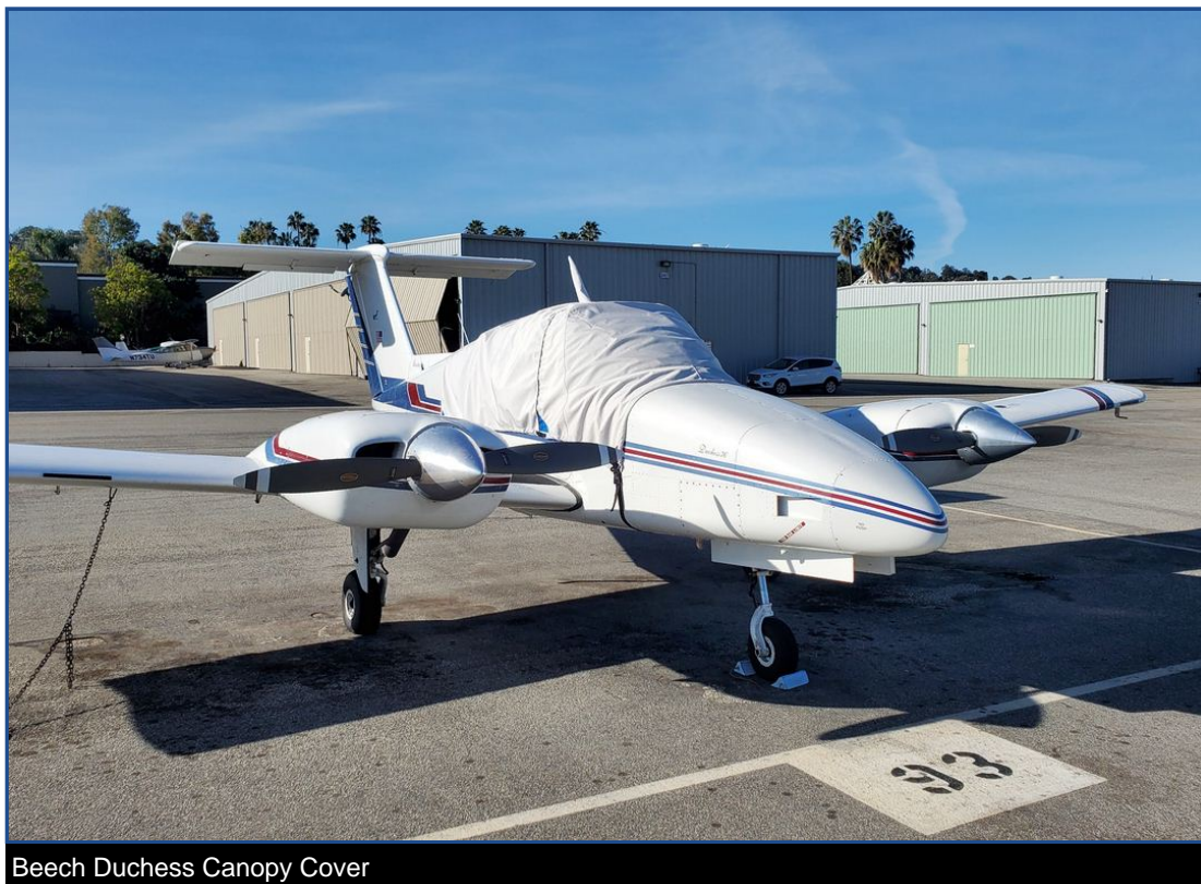
Beech Duchess Canopy Cover