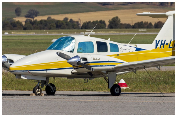
Beech Duchess B76 Heatshield Set