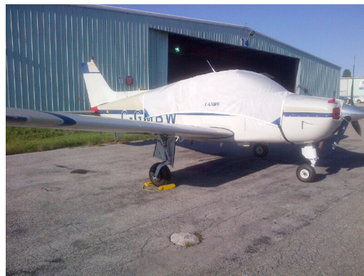
Beech Sierra Canopy Cover, Engine Plugs, Tailcone Cover