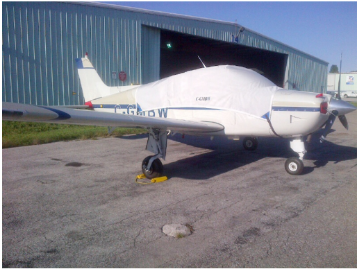
Beech Sierra Canopy Cover, Engine Plugs, Tailcone Cover

plugs are imprinted with the aircraft registration number in black for an extra charge. Storage bag NOT included. Engine plugs may be inserted after flight when the engine is still warm. Engine Inlet Plugs are commonly referred to as Cowl Plugs, Intake Plugs, Cowl Blocks, Engine Blocks, and Engine Bungs.