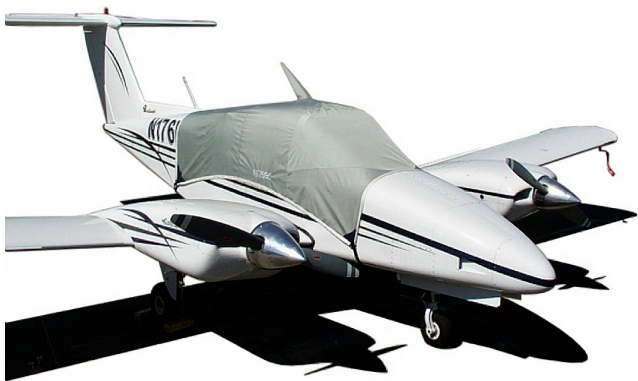
Duchess Standard Canopy Cover