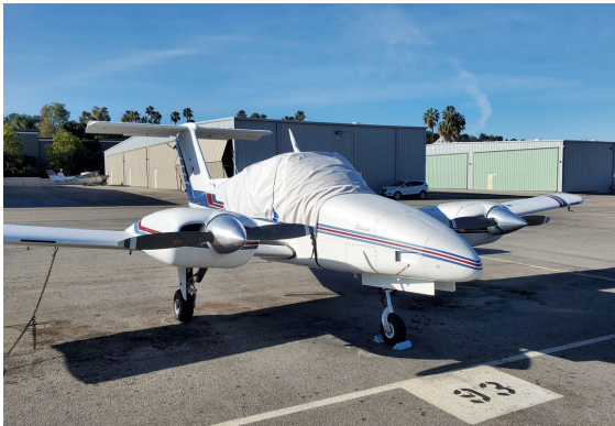
Beech Duchess Canopy Cover