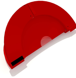
Airbus A330 Intake Plug, framed bi-fold type