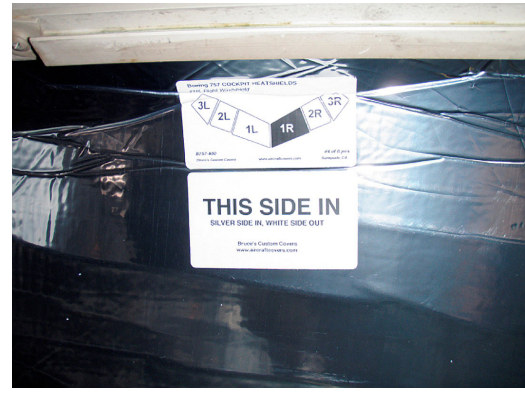
Boeing 757 Cockpit HeatShield set, installation detail