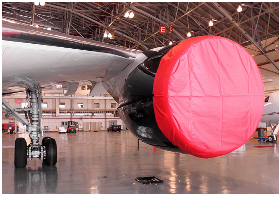
Boeing 767 Intake Covers, P/N: B767-105