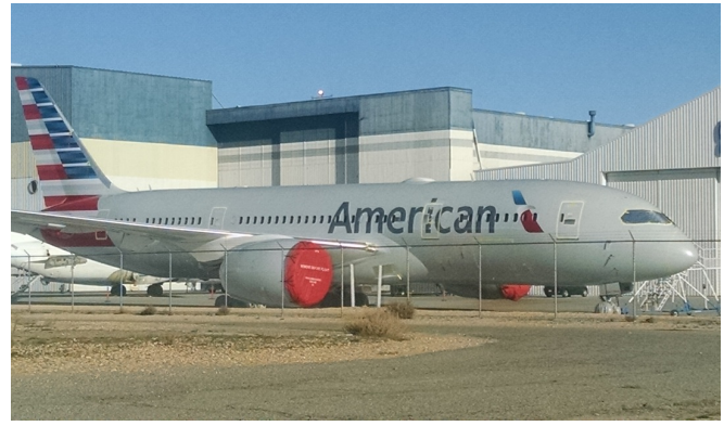
Boeing 787 Intake Covers