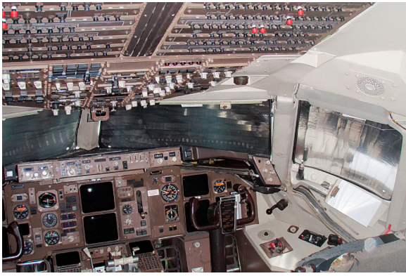
Boeing 757 Cockpit HeatShield set