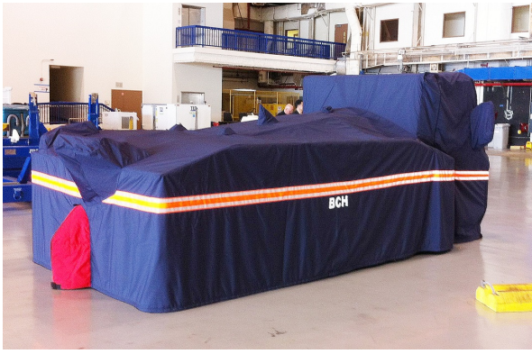
Complete Cover for Eagle Tug