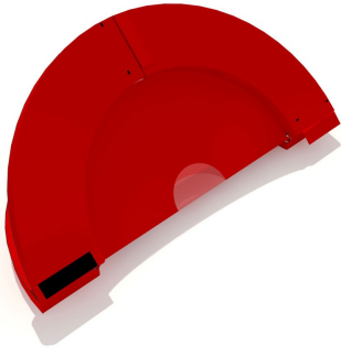
Airbus A330 Intake Plug, framed bi-fold type