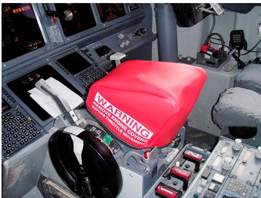
Boeing Throttle Quadrant Cover

ALL-YEAR USE MATERIAL - Made with Silver Acrylic Sunbrella canvas, the all-year use material is the best option for sun protection and cover longevity. This heavier more durable material is intended for all weather conditions, such as rain and snow or lots of sun.