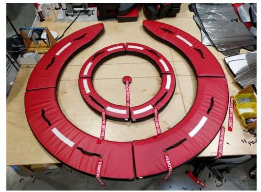
Boeing 747-8 Exhaust Plugs