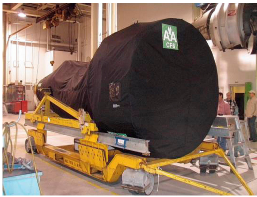
QEC Off-link Engine Cover / Tarp / Bag