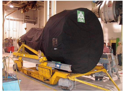
QEC Off-link Engine Cover / Tarp / Bag