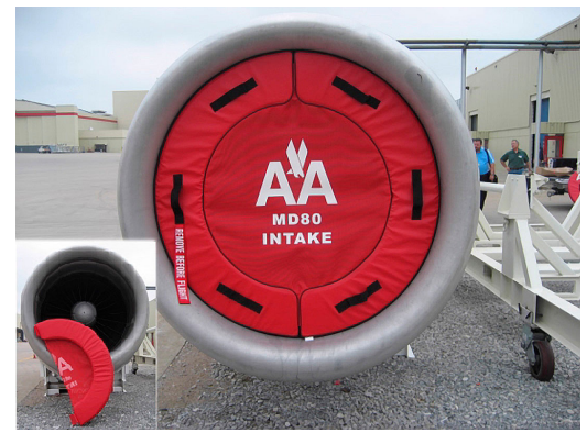
MD-80 JT8D Intake Plug, mesh center & folding type