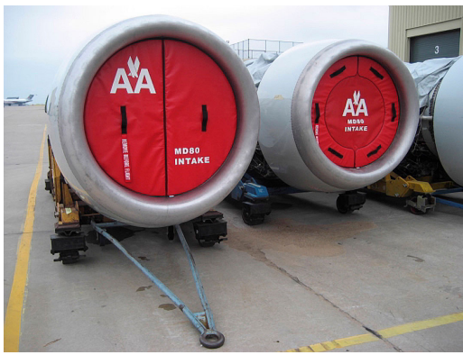
MD-80 JT8D Intake Plugs, Solid Foam folding type& Mesh Center folding type