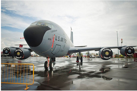
KC-135 Intake Covers, "Tambourine" type